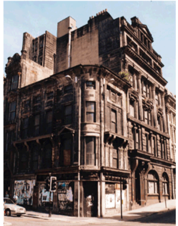
Site 2. Grey Street / Mosley Street, 1998