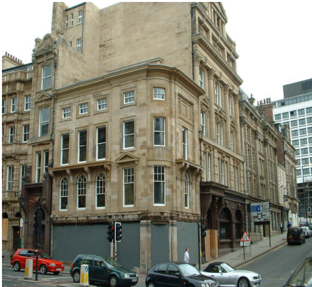
Site 2. Grey Street / Mosley Street, 2003