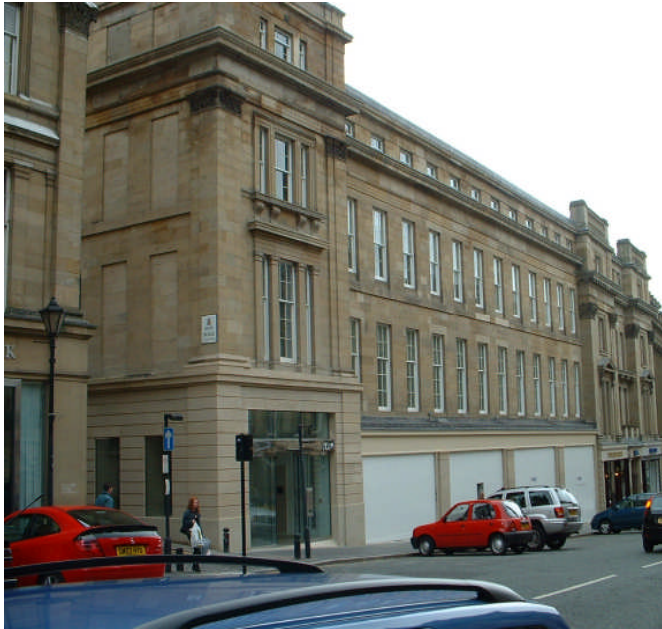
Site 1. Lloyds Court, Grey Street, 2003