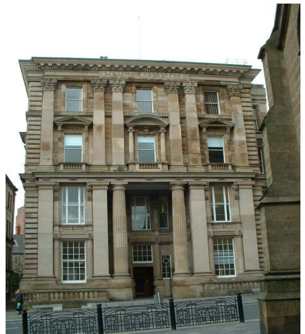
Site 3. 'Red Box', St. Nicholas Street, 2003