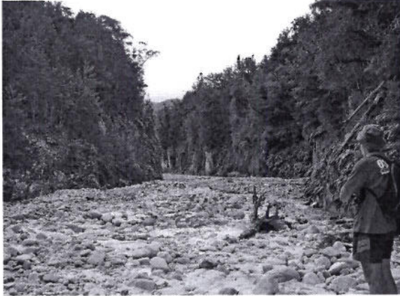
Fig. 5 View of the lower gorge section of Ram Creek with the landslide outburst flood sediment.

out, currently showing large scale aggradation. An additional factor suited to the physical modelling is that Ram Creek crosses the Lyell Fault below the dam site, interpreted to have been reactivated during the 1968 earthquake with downthrow to the west (Yeats, 2000).