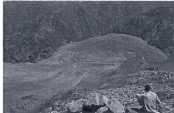
Fig. 1 Chronic supply of debris altering a landscape for an as yet unknown period of time, the 2005 Hattian Bala rock avalanche deposit.

In tectonically active mountain belts catastrophic landslides are an extremely efficient mechanism of delivering large quantities of sediment to river networks. Onsite impacts of the delivery of material can range from near immediate dispersal of the input, a long-lasting point sediment source, to a full blockage as a landslide dam of uncertain persistence that can be measured in days to millennia. Much research has focussed on these immediate aspects of the coupling between landslides and the drainage network for hazard and risk (Dunning et al. 2006, 2007). More recently researchers have tried to integrate state-of-the-art fluvial geomorphology and hillslope science over a diverse range of temporal and spatial scales (for example Korup, 2005, Hewitt 2006). The key limitation for such studies is usually the timescales of interest when considering the impacts such landslide-river coupling has on the landscape. Traditionally the techniques of choice either substitute space for time and attempt to link a sequence of 'process snapshots' to provide a reasoned and coherent model of landscape response; or, use highly dynamic landscapes where the geomorphic lag-time is measured in