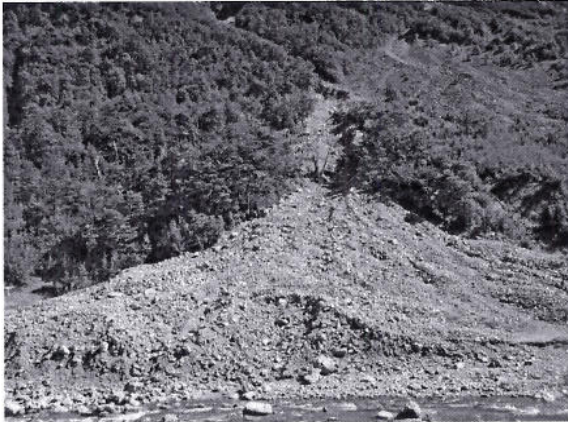
Fig. 2 Pulsed supply of debris being fed into a river able to sluice the toe and disperse the material downstream, Edwards River, New Zealand.

where steady state is a temporally invariant topography, a balance between uplift and erosion. Within this, bedrock or the more commonly observed mixed bedrock-alluvial rivers must transport all of the sediment being supplied from upstream, and also incise its bed at a rate equal to the tectonic uplift (Whipple and Tucker, 2002). With the large number of known events, both chronic and pulsed that exceed 'background rates of delivery', and their interpreted return periods it can be seen that the inputs can have fundamental effects on regional scales in the short term of years to decades and may persist geomorphically for millennia. It is within this framework that equipment has been commissioned to investigate the spatial and temporal impact of chronic and pulsed hillslope-river coupled debris as it is dispersed through the landscape.