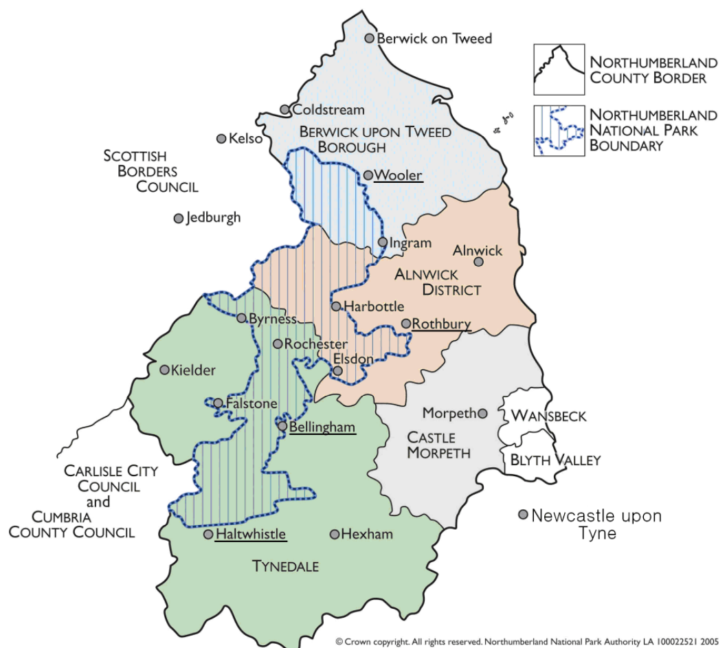
Map showing Northumberland National Park boundary and the Northumberland District Authority boundaries, with the gateway settlements underlined.

Northumberland National Park was designated as a National Park in 1956. Since its inception the Park's boundary has been carefully drawn to prevent the inclusion of the area's larger settlements. These settlements are located just outside the Park boundary and are underlined in the map below. Consequently, at around 2000 people, Northumberland National Park's population is much smaller than any of the country's other Parks. With an area of 1049 square kilometres the population density is also comparatively very small (only 2 people per square kilometre). Northumberland National Park Authority owns only 2.5 square kilometres of this land; private landowners, the Ministry of Defence and the Forestry Commission constitute the area's largest landowners (as detailed on the Park Authority's website in 2008).