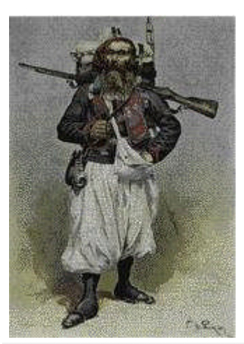
A flamboyantly dressed élite French force, but as a foreigner he was only able to join the French Foreign Legion.

James Stephens, forever trying to re-ingratiate himself into Fenian circles since his fall from grace in the mid-1860s, had also responded to pressure from his supporters in Ireland to form an Irish unit in support of the French at the outbreak of the war. This, however, appears to have had little tangible effect other than a mooted drawing together of the divided Fenian movement. Instead, Stephens travelled to Paris alone and attempted to engage the embattled government of the French Republic.