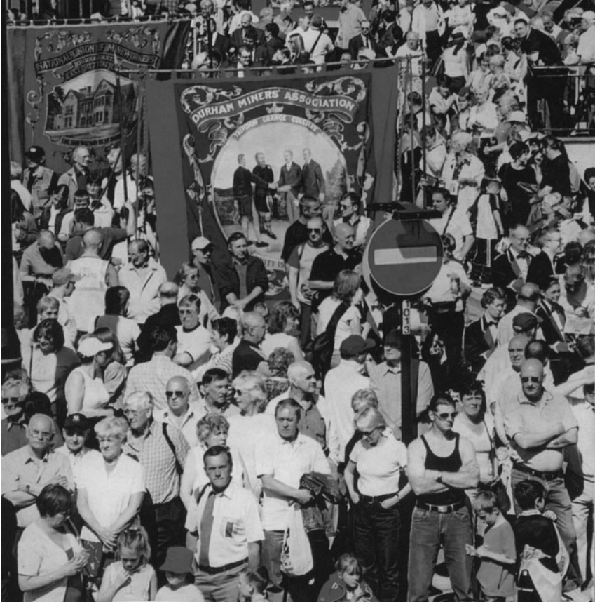
The crowd at a recent Durham Gala.

The motto on one of the banners puts this view more succinctly: WE BUILD OUR FUTURE ON THE PAST.