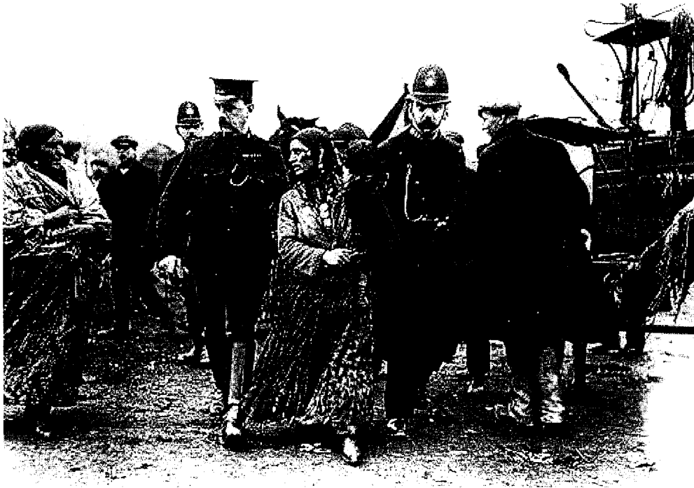
(7. Hungarian Gypsy Coppersmiths being escorted by two policemen c. 1911)

In 1907 Dora Yates of the Gypsy Lore Society wrote that: