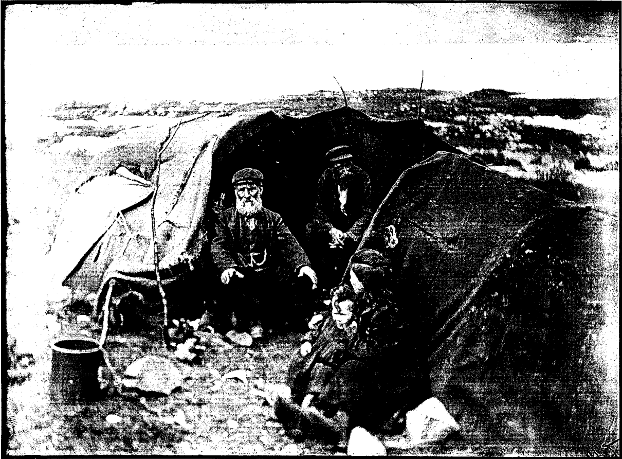
(6. A Tinker's encampment on the west coast of Argyll c. 1910. During the First World War it became increasingly difficult for such groups to find land on which to camp and many such families were forced into slum accommodation in the towns).