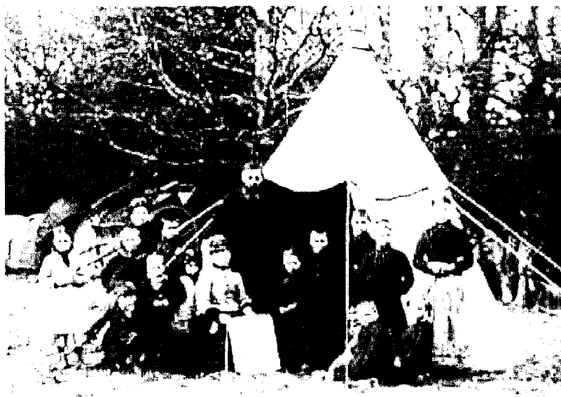
(10. An unknown missionary photographed among the gypsies of the New Forest in 1895)

In the first decade of the twentieth century, a number of small-scale missionary and charitable groups also remained focused on settling the Gypsies. Of particular interest is the