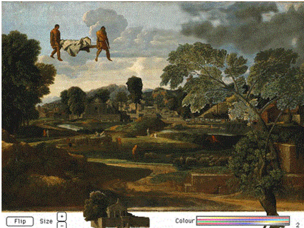
Figure 3: 'Episode 2' in Art Explorer. The paintings in this section are 'live'; that is parts within them can be moved or changed in various ways by the user. Parts can be moved both within and across paintings and users can change the size and axis of various ingredients to experience for themselves the results of altering the painting. [An interactive demonstration from Episode 2 is available in the Web version of this article]

A number of thematically linked sequences build out of this free experimentation. Users are given a range of visual puzzles to solve which require them to look increasingly closely at details as they change the paintings' appearance in various ways. To solve the puzzles, learners need to consider the different ways artists have handled the ingredients at their disposal. Thus learners are drawn gradually towards thinking about paintings as made objects, rather than as mysterious phenomena, and gradually self-discovery blends with guided discovery. The emphasis throughout Art Explorer is on user activity, but perhaps this sequence - where learners experiment with their visual understanding by manipulating their perceptions - is particularly vivid. It demonstrates one way in which multimedia can act as a dynamic intermediary between expert and beginner. In this example, the mediation resides in learner activity: the feedback beginners receive is meaningful because it is intrinsic to their own actions. The teacher or expert