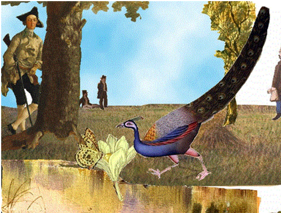
Figure 5: 'Episode 4' in Art Explorer. Users are provided with various ingredients (flowers, people, some background and so on) and invited to build these into a design for their own painting. The painting they construct has to serve a function, and users are given a choice of commissions (e.g. an advertisement or an illustration of a proverb). The user here has illustrated the proverb 'Pride comes before a fall'.

Finally, Episode 4 takes students to another practical issue: the notion of function. Users are provided with various ingredients (flowers, people, some background and so on) and invited to build these into a design for their own painting (Figure 5). However the painting they construct has to serve a function, and users are given a choice of commissions (e.g. an advertisement or an illustration of a proverb). This practical task re-invokes many of the 'illusionary' issues raised in earlier episodes but requires an engagement with the problem of how to achieve the desired illusionary and emotional effect and meet the demands of a commission.