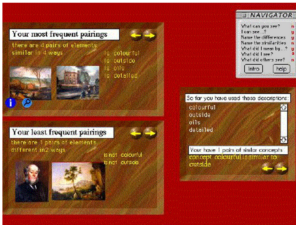
Figure 2: Episode 1 then challenges users to elaborate and refine their own concepts, and to re-examine the paintings. Here the user is shown an analysis of the ways that they had categorised the paintings.

Episode 2 is more dramatic. A large part of its texture consists in surprising viewers with what they can do and in encouraging them to be curious about what they can see. It thus has a strong 'play' element that is designed to be fun as well as attention-grabbing and thought-provoking. The paintings in this section are 'live'; that is parts within them can be moved or changed in various ways by the user. Parts can be moved both within and across paintings and users can change the size and axis of various ingredients (Figure 3). Again, as in Episode 1, it would not have been possible for users to do these things, or for them to be the focus of attention via traditional teaching media.