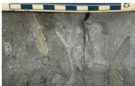
Figure 2. Burrowed contact in the Miocene section at a depth of 204 m. Scale in cm; core top at left.

Post-impact sediments: The cored post-impact section (125 to 444 m) consists of fine-grained, siliciclastic continental-shelf sediments (Fig. 2). A preliminary assessment of depositional sequences suggests: 1) two possible sequences in the upper Miocene Eastover Formation (ca. 6.7-6.9 Ma); 2) one upper Miocene St. Marys Formation sequence, 3) ~4 middle Miocene Calvert Formation sequences; 4) several very thin lower Miocene-Oligocene sequences; and 5) a very thick upper Eocene Chickahominy Formation. The Oligocene-lower Miocene section is surprisingly condensed. The section in the Eyreville corehole is very similar to that in the nearby Kiptopeke corehole, although the upper Eocene section is more expanded at Eyreville.