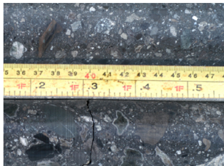
Figure 4. Suevite from a depth of about 1,400 m. Scale in cm and tenths of ft; core top at left.

The suevites or suevitic breccias are cohesive, lithified, and contain variably angular clasts of probable impact-melt rock, and fragments of cataclastically deformed metamorphic and igneous target rocks, in an apparently unsorted matrix of similar but finer grained material (Fig. 4; Table 1). Lithic breccias are polymict and resemble the suevite except for a lack of evident impact-melt clasts.