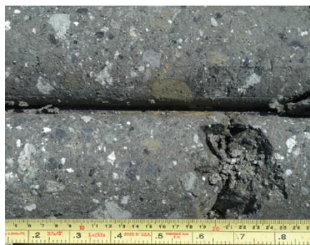
Figure 3. Sediment-clast breccia (Exmore breccia) from a depth of about 522 m. Scale in cm and tenths of ft; core top at left.

Impactites: Matrix-supported sediment-clast breccia (Fig. 3, Table 1) constitutes the uppermost part of the impactite section. This breccia overlies thick sections of Cretaceous sands and clays that probably represent slumped megablocks.