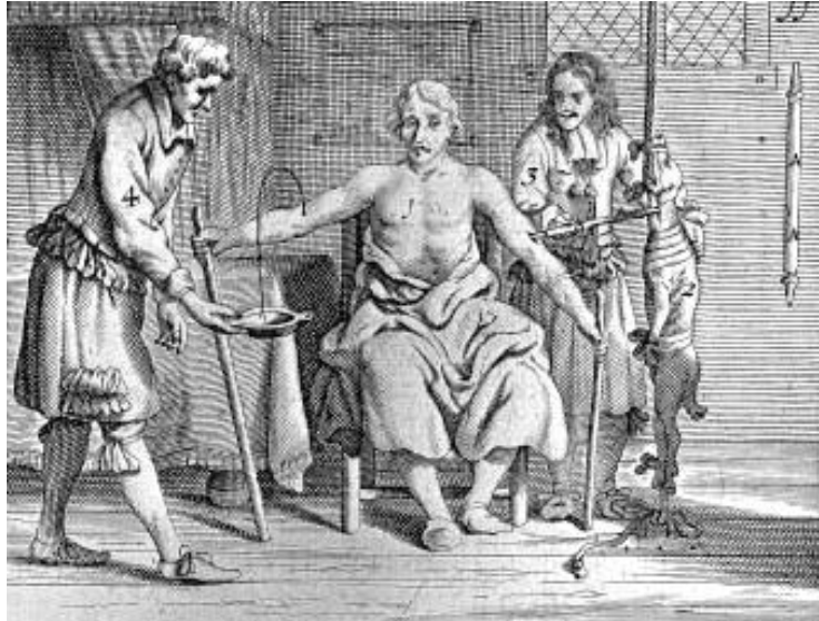
Image 2: Xenotransfusion procedures were rarely performed. Yet they were soon represented in a variety of medical treatises. Here a patient is having blood let from his right arm, while the blood of a bound dog is transfused into the left arm. Central panel of an engraving circa 1692. (Source: Johannes Baptista Lamzweerde, Appendix ... Ad Armamentarium Chirurgicum (Boutesteyn Leyden, 1692), 28. Image reproduced courtesy of the Wellcome Library London.