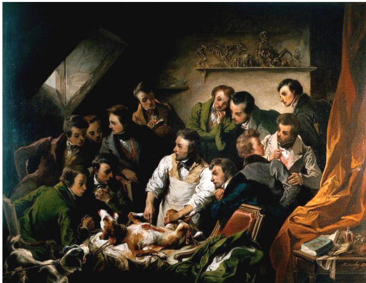
Image 1: A physiological demonstration with vivisection of a dog. Oil painting by Emile-Edouard Mouchy, 1832.

While pedigree canines were more likely to join other domestic species in being subjected to interventions framed from within an organised body of medical lore, little regard was given to the welfare of itinerant crossbreed curs except as a potential source of disease. 12 These otherwise valueless dogs had, however, long been an occasional participant in one other type of cultural activity. Since antiquity their bodies had been a locus for the acquisition of natural philosophical knowledge from which it was possible to draw medically relevant analogies. Mid-nineteenth century veterinarians were well aware of the expansion of these animal-based experimental programs, as many of them were closely associated with the newly established veterinary colleges in Alfort, Berlin, and Bonn. These institutions, apart from educating equine veterinarians, provided a forum for the continuation of systematic animal-based research in the sciences of physiology and pathology. 13