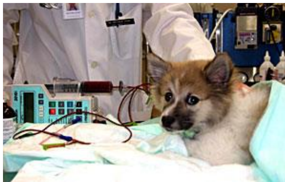
Image 4: ‘Bruno’—a three-month-old American Eskimo cross-breed—receives blood donated by ‘Onyx’ the Greyhound at Western College of Veterinary Medicine in Canada.

data confirmed that any two randomly selected dogs would be compatible in three out of four cases, because of a relatively weak cross-agglutination reaction in the canine. 47 The weakness of the reaction, however, meant that tests for incompatibility were poorly trusted. Consequently the rule of thumb remained that cross-breed dogs were a universal donor and transfusions between pure-breeds should be avoided if possible. To meet the needs of their patients, many veterinary hospitals in Britain and North America established colonies of ‘well looked after’ large cross breed dogs as in-house donors for direct transfusion and blood banking. 48 Later studies confirmed that this caution was warranted. The narrowed gene pool within specific breeds made these individuals far more likely to have a blood type incompatible with trouble-free canine blood donation. 49