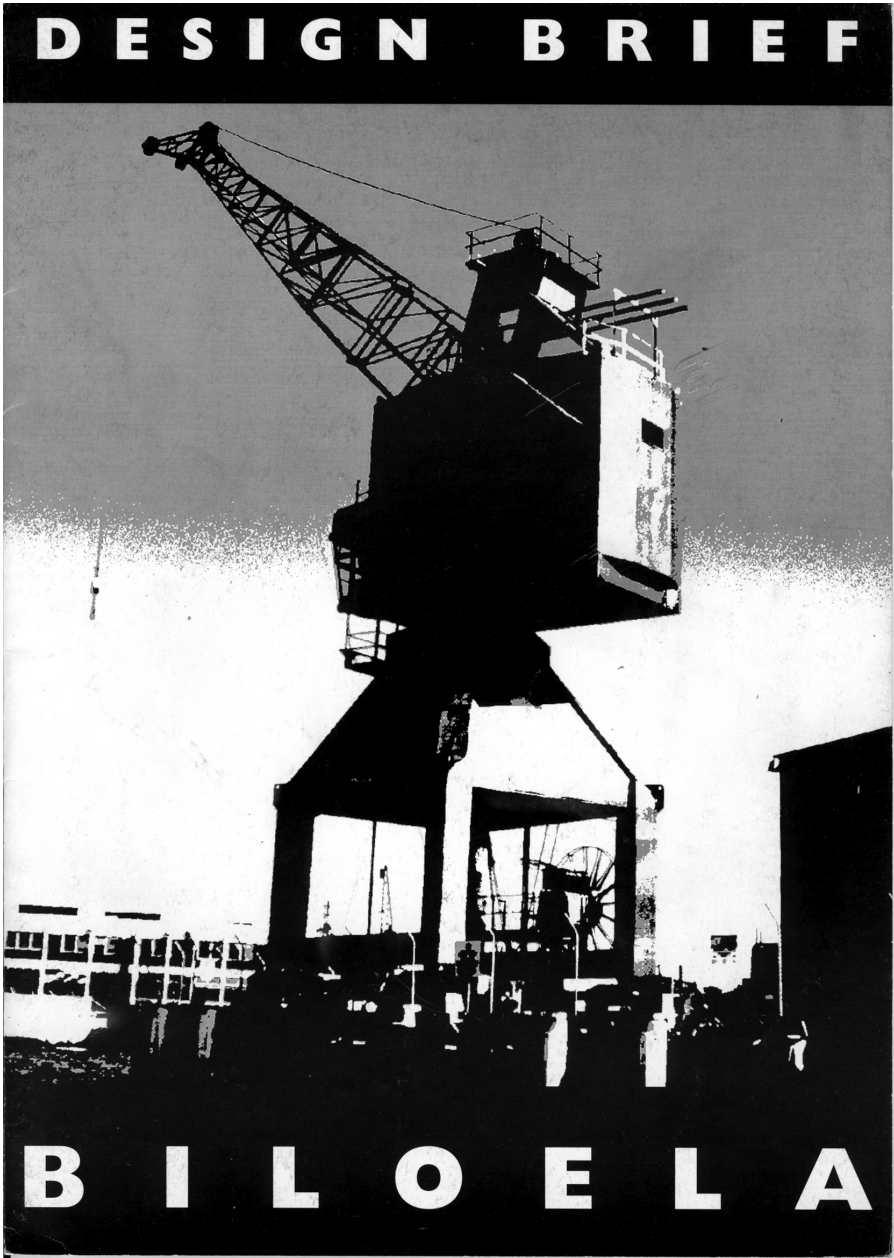
FIGURE 1B: FRONT OF BILOELA COMPETITION BRIEF