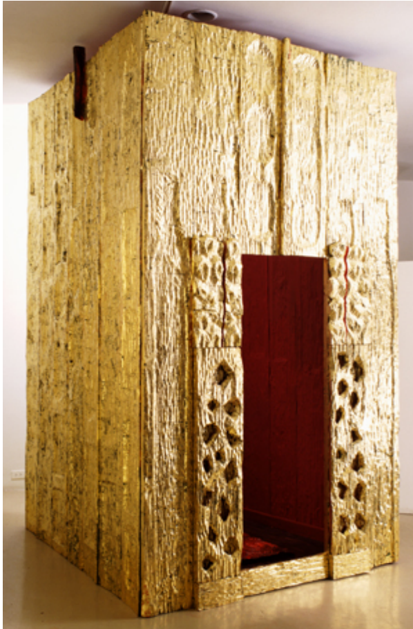
Figure 1 - Spirit House of the Mother , Nancy Azara (1995)

natural cycle of the physis , nature. In this sense we can see how the colour red has come to identify the world of the dead. 66