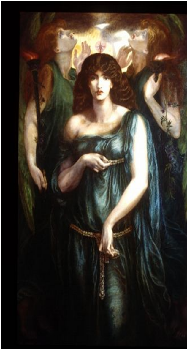
Figure 3 - Astarte Syriaca , Dante Gabriel Rossetti (1887)

It is interesting to note that Gilbert and Gubar have placed Dante Gabriel Rossetti's Astarte Syriaca as an opening illustration to their book.