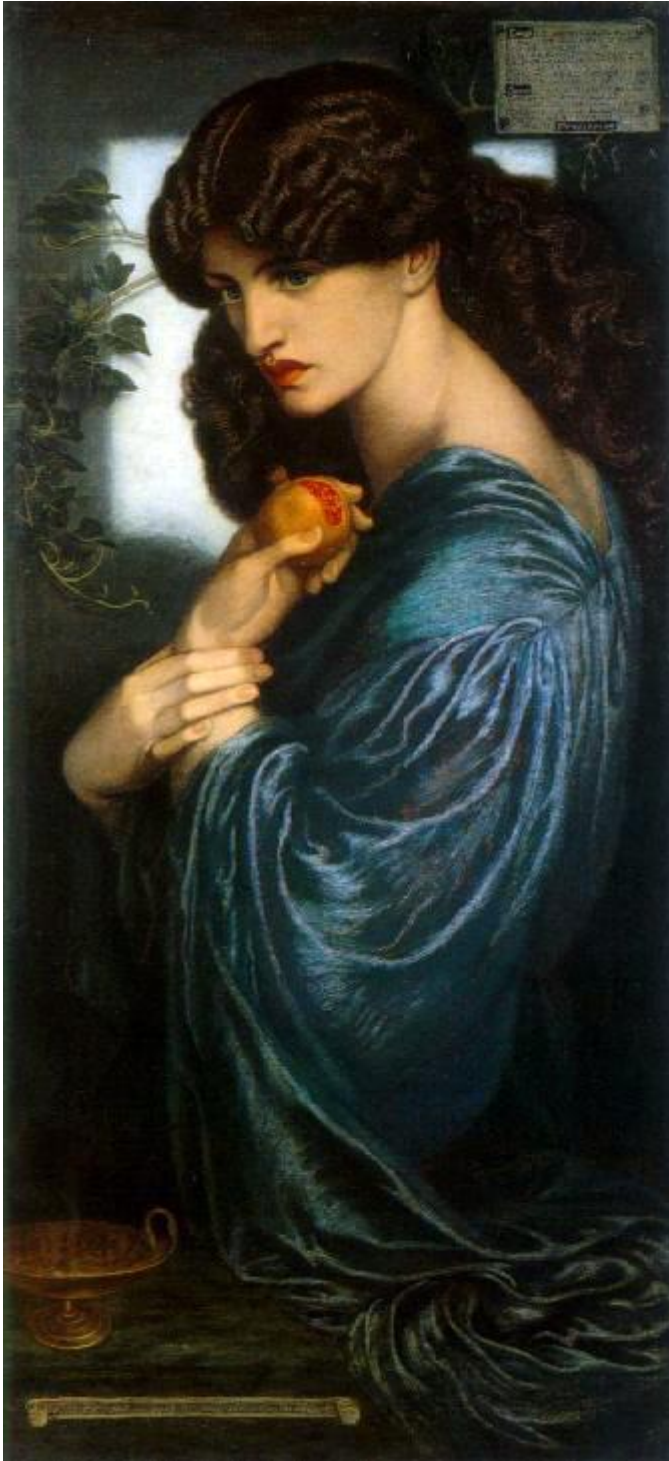
Figure 8 - Proserpine , Dante Gabriel Rossetti, 1874.

I like this image of Persephone better, choosing her own fate. 97