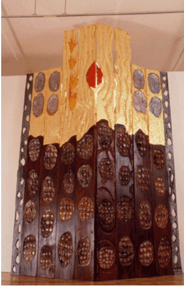
Figure 9 - The Goddess Wall, Nancy Azara (1991)