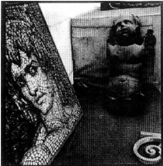
Figure 6 - Church statuary and mosaic; Trapani. 41