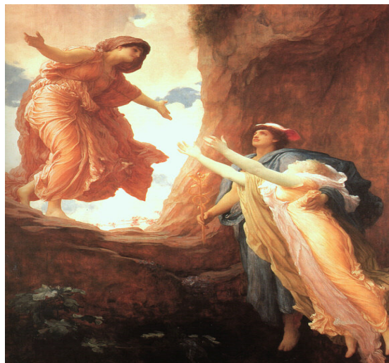
Figure 2 - Return of Persephone, Frederic Leighton (1891)

Writing a memoir for these women is not a mere annotation of facts and emotions of the past. Rather, as argued by Louise DeSalvo, writing a memoir is healing insofar as one writes ‘in a way that links detailed descriptions of what happened with feelings – then and now – about what happened’. 78 This particular aspect allows the writer to retrieve the past and observe how it affects one’s present. At the same time, however, by writing, the subject perceives how that past has changed and how, often, it can be changed by the act of writing itself. While recomposing the past, the ‘I’ of the writer is in a process of evolution, not yet completed, but no longer what it used to be; it is an ‘I on the threshold’. In the painting The Return of Persephone by Frederick Leighton, for instance, the goddess is portrayed on the threshold, between the upper and the underworld, in the act of ascending back to the earth. In Claudian’s Rape of Proserpine , when Demeter cannot find her daughter, the poet writes ‘ Persephone nusquam ’, ‘Persephone is nowhere’. Persephone, however, stuck on the threshold, is at once nowhere and everywhere; she inhabits a status of no longer and not yet, underpinning the process of becoming and identity formation.