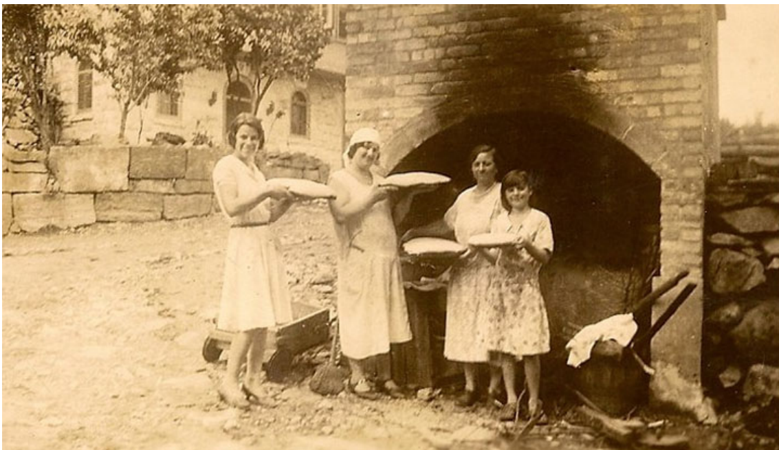
Figure 10 - Making 'a bizz; Waterbury. 103

Miss Collins doesn't know the smell of pig shit on a hot summer day that filled the nostrils of my mother and her sisters as they picked bones out of the pig manure to sell, because it was a hard time for her family. 102