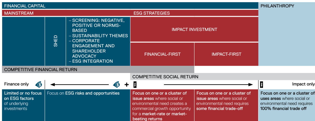
Figure 4: An emerging capital continuum