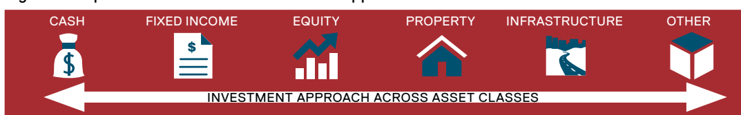
Figure 3: Impact investment - an investment approach across asset classes