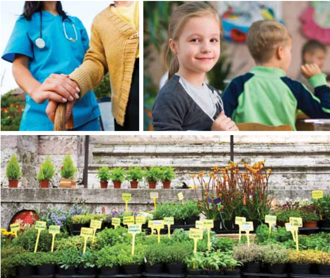
Investors have made impact investments across a range of sectors