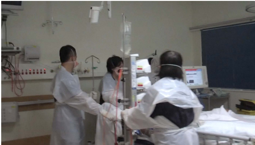
Figure 2 Transferring a patient from the ward to an isolation room.

gloved hands without an opportunity to perform appropriate hand hygiene.