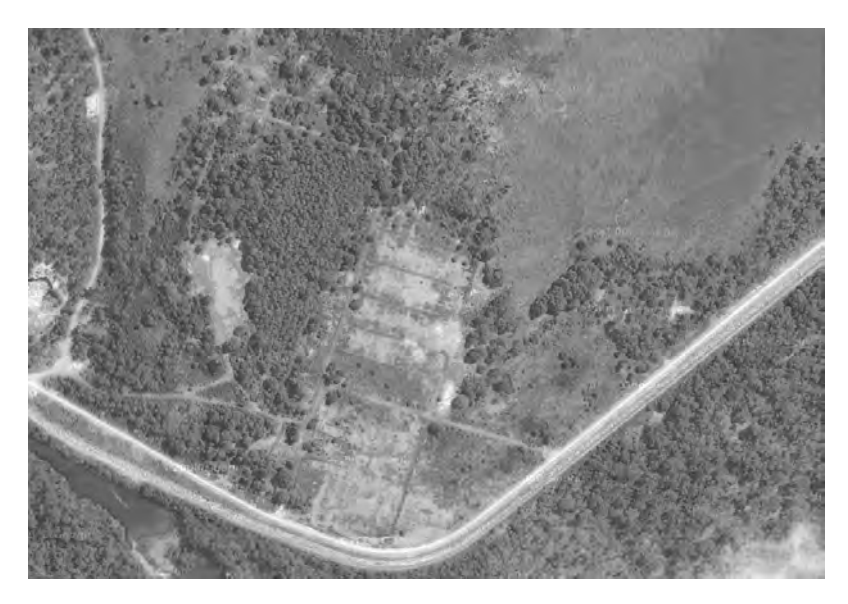
Figure 3 Butlers Gorge Town Site (Google Maps)

such place. The fact that the location was wilderness, and still is, meant nothing to Marchant. Craycroft perfectly suited the narrative requirements of her story.