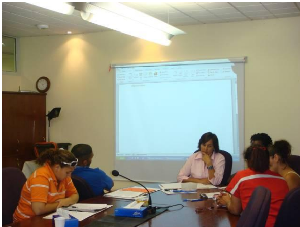
Developing inclusion and exclusion criteria

Over the course of the workshops, research processes and materials fundamental to the project in Townsville were developed. These included inclusion and exclusion criteria for participants; a map of key field sites for recruitment and a recruitment plan; and a list of topics and questions for the individual and group interviews. In this way, peer researchers, health service staff and university-based researchers collaboratively developed project questions reflecting local priorities and meanings, and established ways of conducting the project that were appropriate to the priority population and the local community.