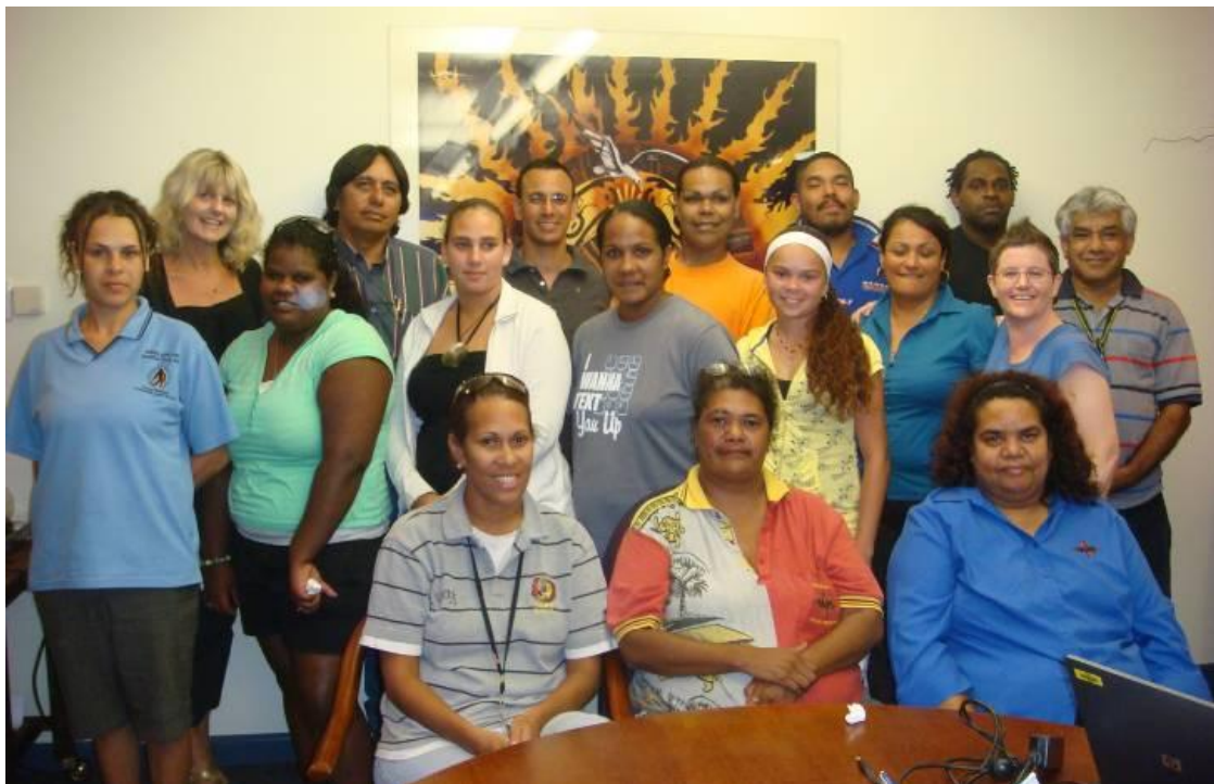
Participants in the Research Development and Training Workshop, February 2008

The university-based researchers developed a three-day research development and training workshop covering research ethics, communication, sampling and recruitment, individual and group interviewing, participant observation, writing field notes, and analysis of qualitative data (Erick et al., 2008). The workshop was tailored to the educational level of the attendees and the content adapted to reflect the focus on homelessness and residential insecurity among young people. Eight peer researchers and seven health services staff participated in the workshop.