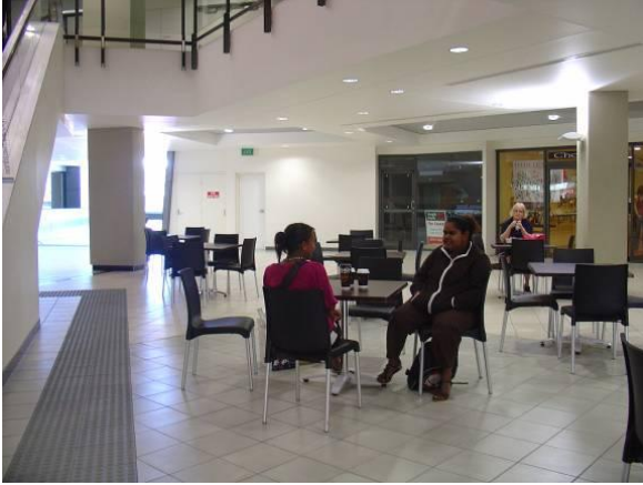
Recruitment site, Flinders Mall