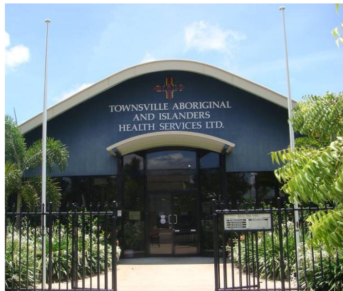
Townsville Aboriginal and Islanders Health Service