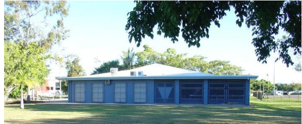
Recruitment site, Dean Park Drop-in Centre

Data collection was a time intensive process with the project team spending significant periods of time in the community, meeting and talking with potential participants and conducting interviews. Over the course of the data collection four young Aboriginal and Torres Strait Islander men and women (peer researchers) worked with the site coordinator. As data collection progressed, engagement from the peer researchers declined and only a fifth of the interviews were conducted by a peer researcher. The remaining interviews were conducted by the site coordinator with occasional engagement from a young person who had not been involved in the research workshop at the beginning of the project.