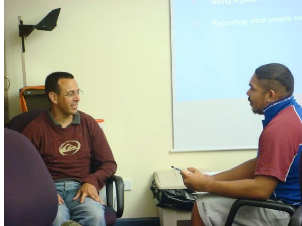
Interviewing role play

Over the course of the workshops, research processes and materials fundamental to the project in Townsville were developed. These included inclusion and exclusion criteria for participants; a map of key field sites for recruitment and a recruitment plan; and a list of topics and questions for the individual and group interviews. In this way, peer researchers, health service staff and university-based researchers collaboratively developed project questions reflecting local priorities and meanings, and established ways of conducting the project that were appropriate to the priority population and the local community.