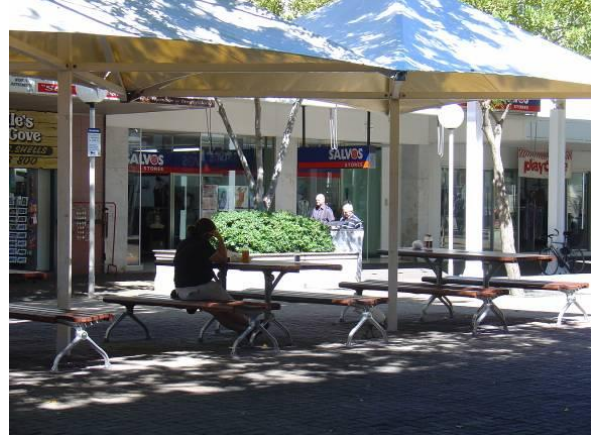
Recruitment site, Flinders Mall