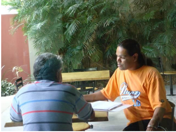
Interviewing role play