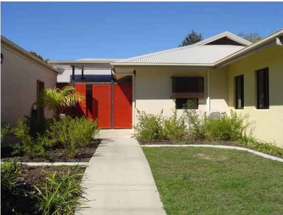
Recruitment site, TAIHS Youth Shelter