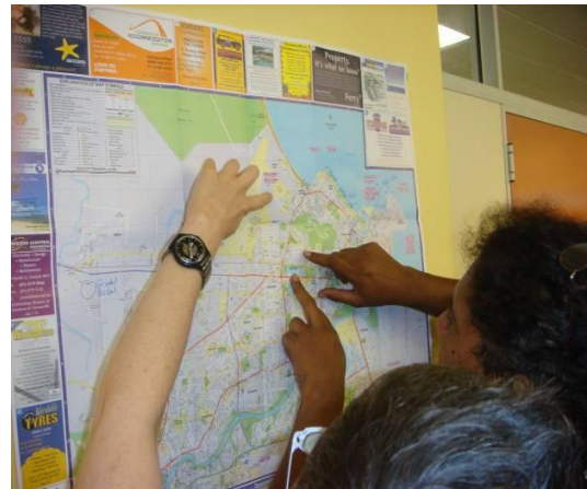
Mapping potential field sites for recruitment