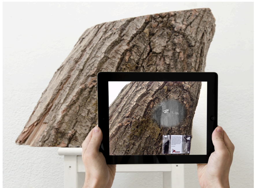
Fig. 5. Our prototype in action.

We presented our application at the ISEA2013 Symposium on Electronic Art where we received feedback on the project. Among other comments, we were asked if we could create a full 3D reconstruction of the bullets since we had already made X-rays from multiple angles. Although we had considered this option during our design process, we chose to