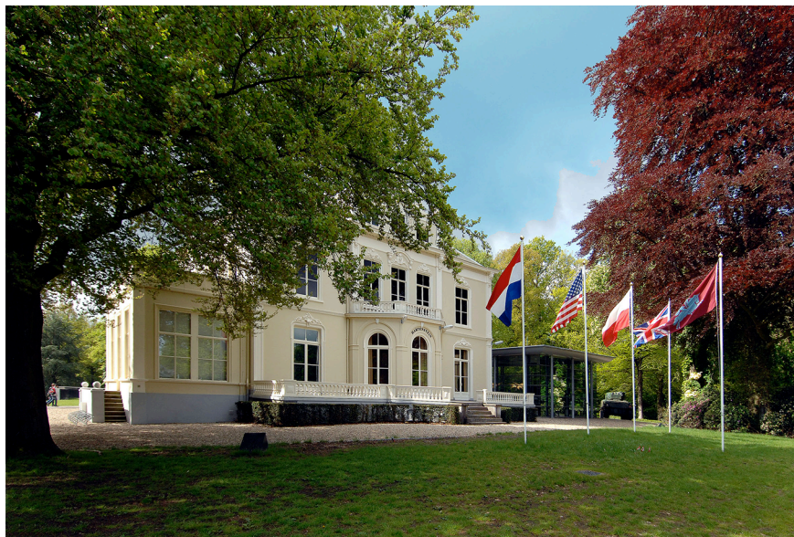
Fig. 1. The villa in which Airborne Museum Hartenstein is housed.

Typically, battlefield sites and military museums are located near or at the original site of events. They are places to experience history where it happened. A wide range of museums are site museums, i.e., museums located at the original site of their subject. Still, what constitutes a site and establishing where