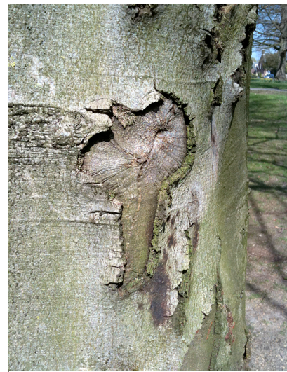
Fig. 2. Scar caused by a bullet which once pierced the tree.

We find it fascinating that these trees have taken on the role of time capsules. The museum itself houses the world's largest collection of militaria from the Battle of Arnhem, but few visitors are aware of the physical remains of the battle in the now peaceful forest just outside the museum. By disclosing the hidden content inside the trees we aim to extend the museum narrative to its surrounding space. We propose an augmented reality application which runs on smartphones and tablets. By pointing the