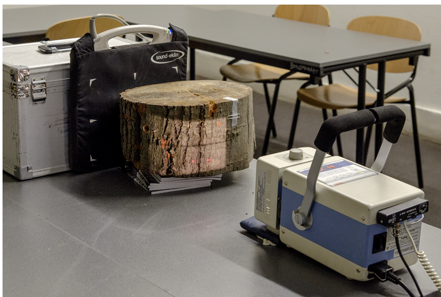
Fig. 3. Scanning our tree trunk with a portable X-ray scanner.

One of the most powerful attributes of augmented reality is its capacity to visualize what is invisible, to make visible what has gone or been replaced. Yet, many aspects of the technology seem to be neglected in the domain of cultural heritage despite their widespread use in other application domains. Consider, as an illustration, several medical augmented reality systems [19]: such systems employ augmented reality to visualize what is inaccessible to human vision rather than what is no longer there. Expanding human vision is core to medical imaging technologies, from X-rays to MRI imaging, and several medical augmented reality systems superimpose views from multiple imaging modalities. The relevance of augmented reality applications that exploit multi-spectral imaging views to cultural heritage applications is nicely exemplified in the "Augmented Painting" project [20]. This project uses augmented reality to visualize "The Bedroom" painting by Vincent van Gogh in different imaging modalities such as X-ray and infrared imaging. Given the particularities of our project,