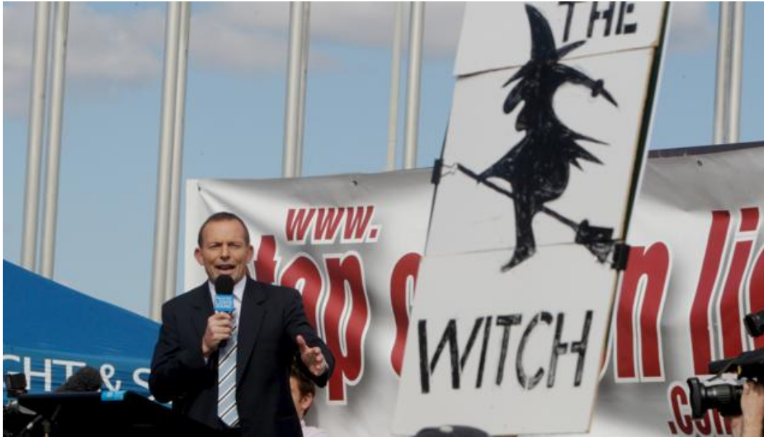
Figure 6: Ditch the Witch