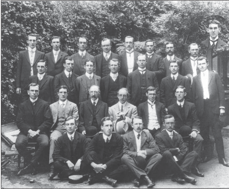
Economics and Commerce III: 1909.

examination and the award of a university commercial certificate, acceptable to both Senate and Chamber of Commerce. Senior and junior commercial examinations were to be introduced in 1905 with an evening course of 30 lectures on economics, accounting, business methods and techniques, to be followed in 1906 with a further evening course of 30 lectures on commercial law, commercial history and geography, and banking and finance. More delays and committees were generated by the New South Wales Teachers Association and resolved over three days in May 1906. As a result, a professorship in economics was to be quickly established for funding by the New South Wales Treasury; a new scheme of commercial education and examination was to be prepared; and business interests in the city were urged to accept both the new commercial education scheme and that its successful students be suitably certified.