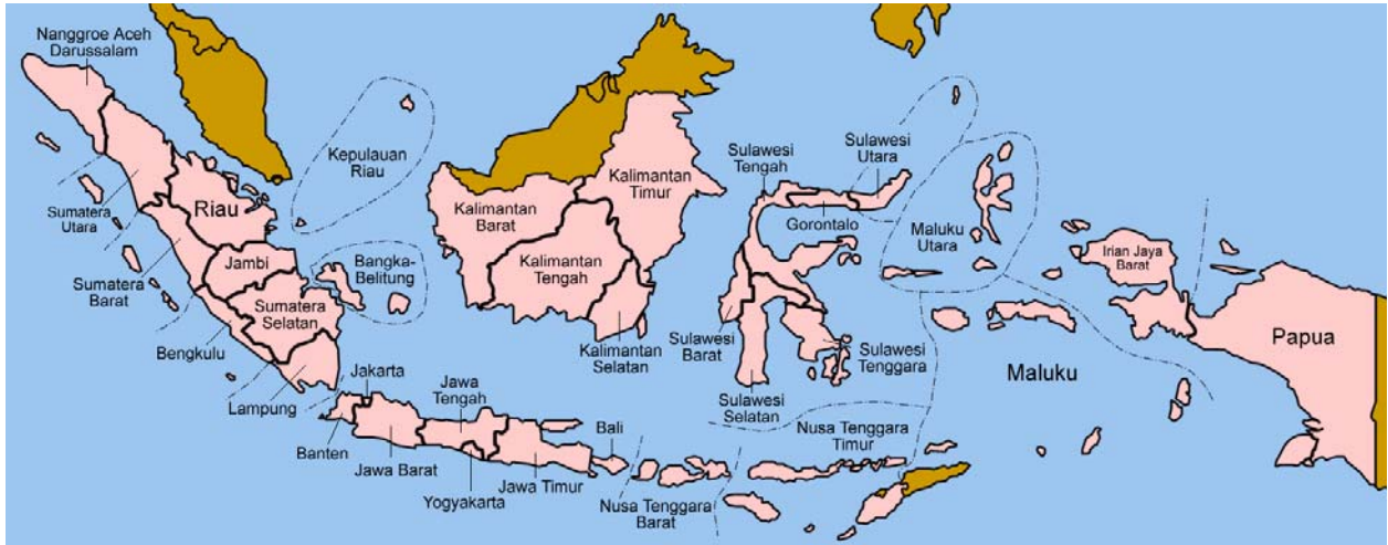
Figure 1: Map of Indonesia