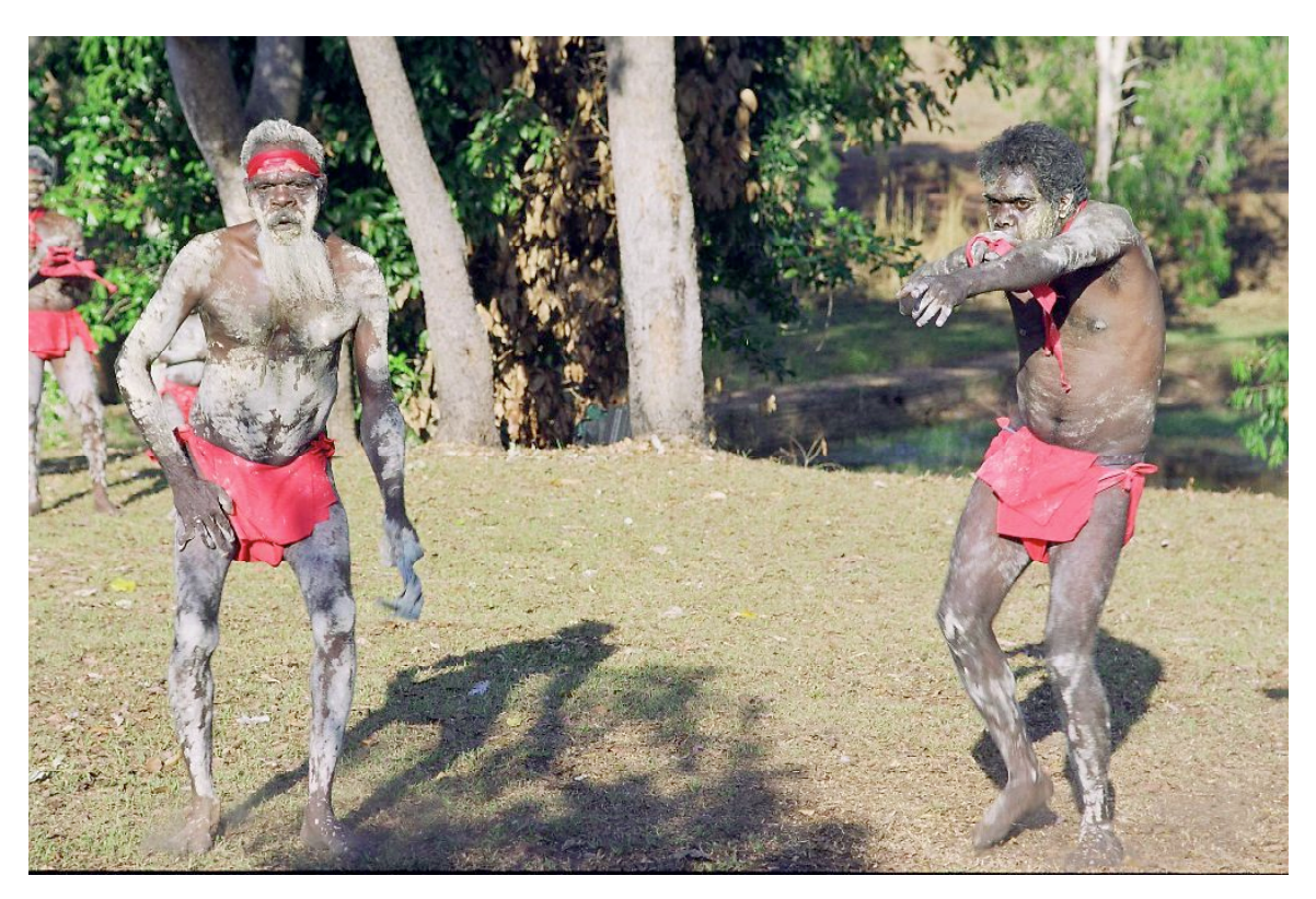
Illustration 2: Men dancing as maruy at a ceremony at the Belyuen waterhole.

The songs and dances performed at these ceremonies emanate from, and invoke the presence of maruy in the form of ghosts.<sup>4</sup> That is to say, songs are given to songmen by ghosts, who sing to the songman in dream. In ceremony, singers reproduce this ghost-given song, while dancers perform as ghosts (see Illustration 2). Moreover, when as in Illustration 2 a person's appearance is reproduced in a photograph (or on film or video), or when the sound of their voice is played back from tape, this too is seen or heard as a manifestation of the person's maruy , and as such it has a certain power.