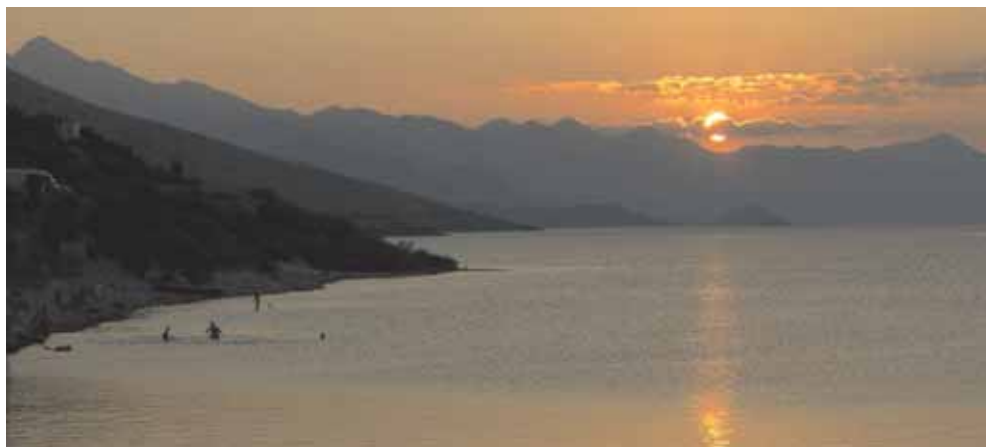
Figure 3 - Sunset in Shiroka, Shkodra Lake.

Prorocentrum minimum . In Kenalla, a relatively deep pond, close to the shallow lagoon of Merxhani, a centric diatom, Chaetoceros muelleri was found to be very abundant. There were also abundant filamentous colonies of blue-green algae, i.e. Anabaenopsis circularis , Oscillatoria sp. and a small peridinieae, Gimnodinium sp. Other preliminary examinations were also carried out in other Albanian wetlands, i.e. Karavasta, Patoku, Viluni, Butrinti, Armura, Saranda and Durrresi harbours; more detailed discussion from the ecological point of view is given in Dedej (2006). High species diversity was observed in Armura, Butrinti and Karavasta. In November 2004, blooming of filamentous cyanobacteria were observed in Narta lagoon, close to the wastewater discharge from Narta village (Miho and Xhulaj, 2005). Rakaj (2002) gives data on the phytoplankton of Shkodra Lake (Albanian part) (Fig. 3). About 468 species of microscopic algae were reported, the areas of Kamica and Shegani (Kopliku) having the highest diversity. Generally, the phytoplankton was dominated by oligo-mesotraphentic species, i.e. Cyclotella ocellata , Asterionella formosa , Fragilaria capucina , etc, often accompanied by tolerant or eutraphentic species, such as Fragilaria ulna , F. construens , Gyomphonema acuminata , Navicula capitatoradiata , N. reichardtiana var. crassa , N. trivialis , N. cryptotenella , N. menisculus var. grunowii , Nitzschia