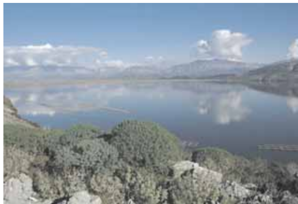
Figure 2 - View of Butrinti lagoon (Saranda)

In the period 1992-93, about 75 species of diatoms were found in the Orikumi wetland, where pennatae dominate (Dedej, 2006). Here too, centrics of Chaetoceros and Cyclotella were abundant, with a similar structure as in Butrinti, but with lower quantity; peridinieae increased during summer, too. Miho and Mitrushi (1999), in July 1996 observed relatively high diversity of microscopic algae in Merxhani lagoon (Lezha). In Ceka, an algal bloom was observed, dominated by Nitzschia reversa , Peridinium spp. , Goniaulax monacantha and