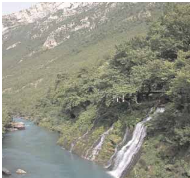
Figure 5 - The spring of Ujit të Ftohtë in Kelcyra (Përmeti) and Vjosa River

(Zvezda), Tirana (Brari), and Shkumbini (Librazhdi) rivers, and in the springs of Kelcyra, Ujit të Ftohtë (Tepelena), Syri i Kaltër (Bistrica), Shalsi (Gërmenj), Sotira (Gjirokastra) and Borshi (Saranda). About 96 species of diatoms were found in these rivers and springs (Kupe, 2006). The TIDIA oscillated from 2.51 (Shalsi-Gërmenj) to 3.29 (Kelcyra), the lowest value being observed in Novosela (1.9). The trophic state in these habitats varies from oligo-mesotrophic (Novosela) to mesotrophic in Gërmenj and Kelcyra (Kupe, 2006). The most common species found in those rivers were: Achnanthes minutissima (up to 40.5% in Gërmenj), Diatoma moniliformis , Fragilaria biceps , Cocconeis placentula , Gomphonema tergestinum . The most abundant species in the springs were: Achnanthes minutissima , Cocconeis placentula , Diatoma moniliformis , D. mesodon , Fragilaria ulna , etc. A. minutissima reached up to 92.9% of the diatom community in all stations, followed by F. ulna and D. moniliformis (up to 78.6%). The TIDIA in the springs oscillates from mesotrophic to polytrophic (Syri i Kaltër). The SI oscillates from 1.4 (Borshi) to 2.1 (Devollin, Erseke and Kelcyra), from oligo-beta-meso-