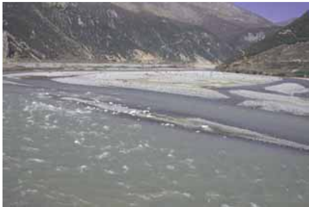
Figure 4 - Shkumbini River in Labinot - Fushe (Elbasani)

in the plain part of the river (Paperi and Peqini), showing heavy inorganic pollution, probably caused by Elbasani town and its industrial activities; the lowest values were found in the upstream parts: Labinot-Fushe and Proptishti.