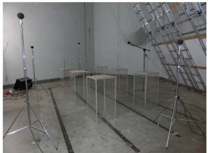
Figure 2. The specimens of rectangular MPP space sound absorbers (RMSA) set in a reverberation chamber. In this photo the top ends of the specimens are closed with removable covers