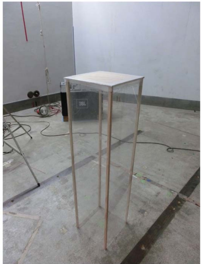
Figure 1. A photograph of the specimen of RMSA used in the experiment (number 1 with a removable cover on the top end)

In previous studies on a cylindrical MPP space sound absorber (CMSA), preliminary experiments were made to check the effect of area. In the present study, preliminary measurements were also made with 2, 4 and 6 specimens (which are separated to each other by 1 m distance, placed on the central area of the floor of the chamber) to observe if the absorption power per one specimen changes with the number of specimens. However, as in the case of a CMSA, the absorption power per one specimen did not change when the number of specimens was changed. As in the CMSA cases, the sound absorption power obtained in the experiment is normalised by the total of the surface area of the specimens so that the value equivalent to the sound absorption coefficient is obtained. All measured data in this work are with six specimens. The absorption coefficient corresponds to the sound absorption power per unit surface area of the specimen by normalising the measured results with the total surface area of the six specimens. Hence in the case of number 1, the specimen surface area is 1 m 2 and the sound absorption power per one specimen is equivalent to the sound absorption coefficient. In the case of number 2, the specimen surface area is 2 m 2 and the measured value normalised by 2 is equivalent to the sound absorption coefficient.