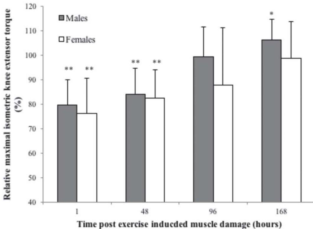
Fig 2. Maximal voluntary isometric knee extension torque loss, one, 48, 96 and 168 hours post exercise induced muscle damage (EIMD) in males and females. Maximal voluntary isometric knee extension torque loss is expressed as a percentage of maximal voluntary isometric knee extension torque pre exercise induced muscle damage. Data is presented as means \pm SD. Significant difference from Pre-damage * p < 0.05 , ** p < 0.01 .