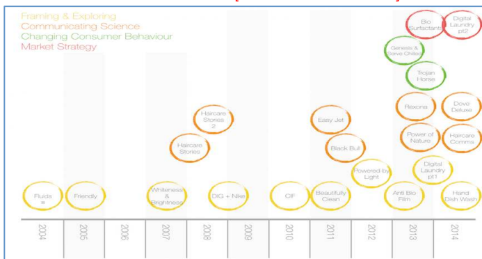
Figure 2 Distribution of project category over time

Figure 2 identifies how the various project categories are distributed over time with a consistent spread of Framing and Exploring projects evident across the timescale. Communicating Science has featured consistently from three years in (this corresponds with the University’s development of its Multidisciplinary Innovation Masters programme), and latterly Changing Consumer Behavior and Market Strategy have started to feature. The volume of project activity has also increased substantially in recent years and a number of projects have involved work in more than one category.