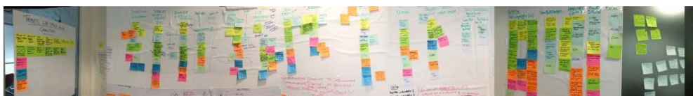
Figure 1 Relationship timeline and project mapping

As the projects have been conducted over a ten-year period, there have been a number of different actors involved from both the University and Company. However, there is a small number of key NUSD staff that have been involved in all of these projects, and these staff were consulted from the outset. Workshops were conducted in which they created a timeline for the projects onto which they mapped key information (Figure 1). This timeline and mapping was conducted at a large scale and on the wall; externalizing the information, and sharing it in this way prompted the recollection of data, and supported the synthesis of data at a later stage (Saldana, 2009). It allowed for recollection over time and for multiple actors to become involved.