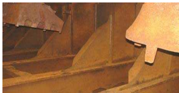
Fig. 1 Marine coating degradation showing rust in water ballast tanks [16]

Before 1880, solid ballast media such as stone, sand and rock were used [15]. These media were bulky and very difficult to handle especially during voyages in extreme sea conditions and resulted in long delays while ballasting or de-ballasting was carried out. These challenges drove the need for an alternative ballast medium and from the 1880s to the present day seawater became the preferred medium [15]. However, this medium came with the challenge of corrosion that ultimately led to the need for WBT coatings.