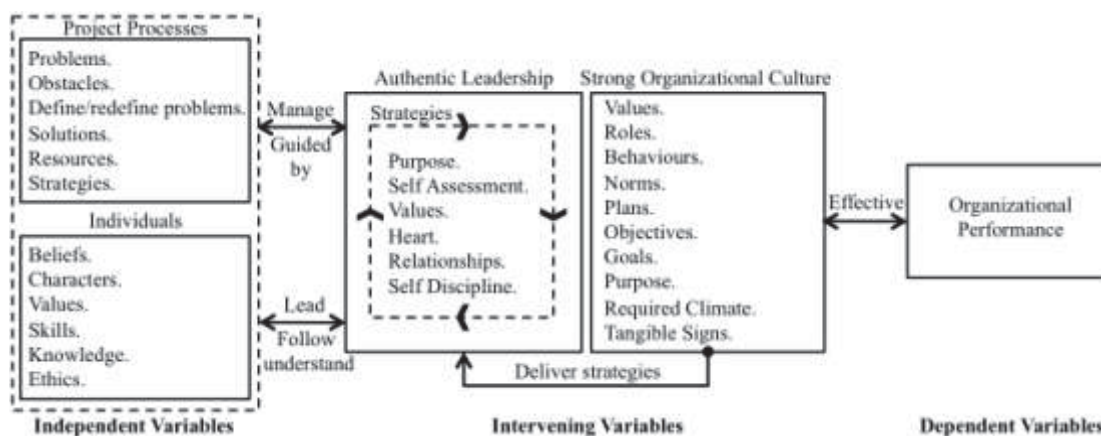
Figure 2: Components and mechanism of the model