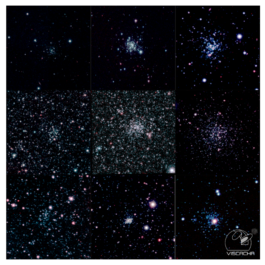
Figure 1. Mosaic of coloured images of the nine clusters analysed in Paper I (Maia et al. 2019) based on V,I images. Each image has a size of 3' \times 3' , North is up, East is left.