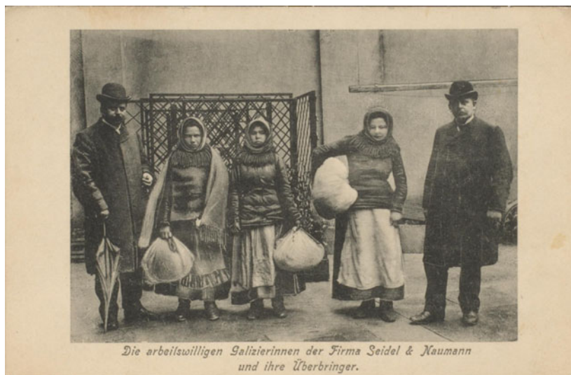
Fig. 1. Women from Galicia described as “willing workers” and the two strikebreaking agents who had recruited them and brought them to Germany.

ignorance of the German language to deceive them with regard to working conditions and pay. 87 An official report by the Austrian Vice Consul in Germany in 1912 was very critical of the foremen who provided fieldworkers to estate owners in Germany. They were reported to have complete control over the agricultural workers, charging them for transport and meals, and in some cases also physically and sexually abusing them. The consul recommended restricting the trade of these private agents as they exerted too much power over the workers, distributing the work as they wanted, and having all the wages paid directly to themselves. 88