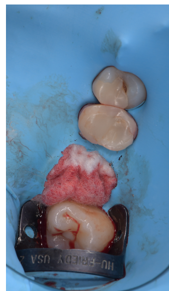
Fig. (3). A gauze swab is placed into the socket in order to stop bleeding.

A gauze swab was placed onto the socket and compressed slightly in order to stop bleeding and wait for coagulation to occur (Fig. 3). After 5 minutes, the socket stopped bleeding and both clamp and rubber dam, were removed. Due to the complete absence of bleeding in the following 20 minutes, sutures were avoided, and the patient was dismissed.