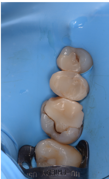
Fig. (1). A rubber dam isolated the whole upper right sextant, arranging the metal clamp on the second molar.

Under local anaesthesia, a rubber dam (Nic Tone, Expertech Solutions, Bucharest, Romania) was placed, isolating the whole upper right sextant and arranging the metal clamp on the second molar (Fig. 1).