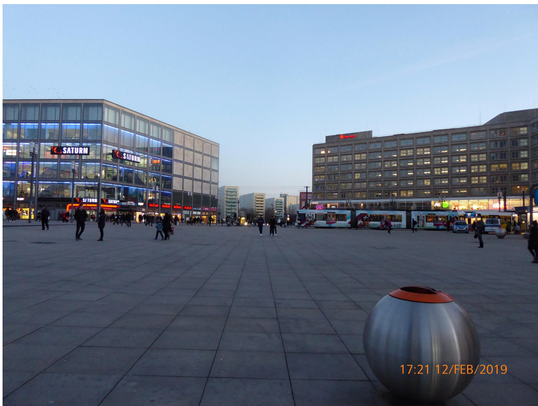
Figure 3. Alexanderplatz.

A public square like Alexanderplatz, which is surrounded by office buildings, shopping centres and hotels, offers residents and visitors little opportunity to identify with the location and makes it difficult to implement meeting places that target a wide variety of user groups to unite and promote significant social control. As a result, it remains mainly a transit space and less an