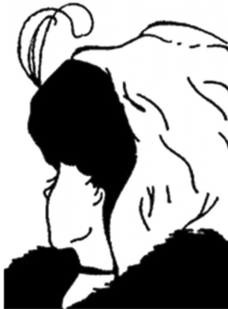
Figure 1. My Wife and My Mother-In-Law, by the cartoonist W. E. Hill, 1915. This media file is in the public domain in the United States. This applies to U.S. works where the copyright has expired, often because its first publication occurred prior to January 1, 1923.

and encode faces does not influence the size of the group difference, suggesting that the bias presents automatically, which is in line with the unconscious age effects on face perception observed by Nicholls and colleagues.