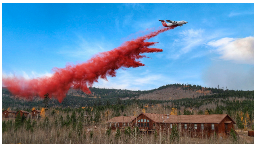
Figure 2. An aerial suppression plane dropped fire retardant along the fire-line just west of the Colorado State University Mountain Campus north dorm. Although the flames crossed the main fire-line, suppression efforts were successful and protected the residential and guest cabins.