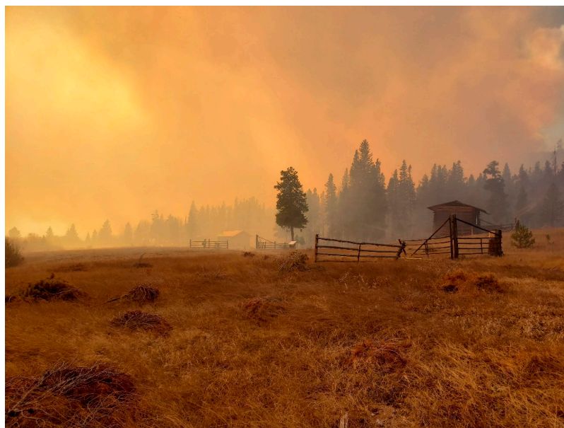
Figure 1. Smoke and ash from the Cameron Peaks fire filled the valley and surrounded the historic Koenig-Ramsey Homestead District at Colorado State University. The heroic efforts of several fire crews successfully protected the >100 years old structures.