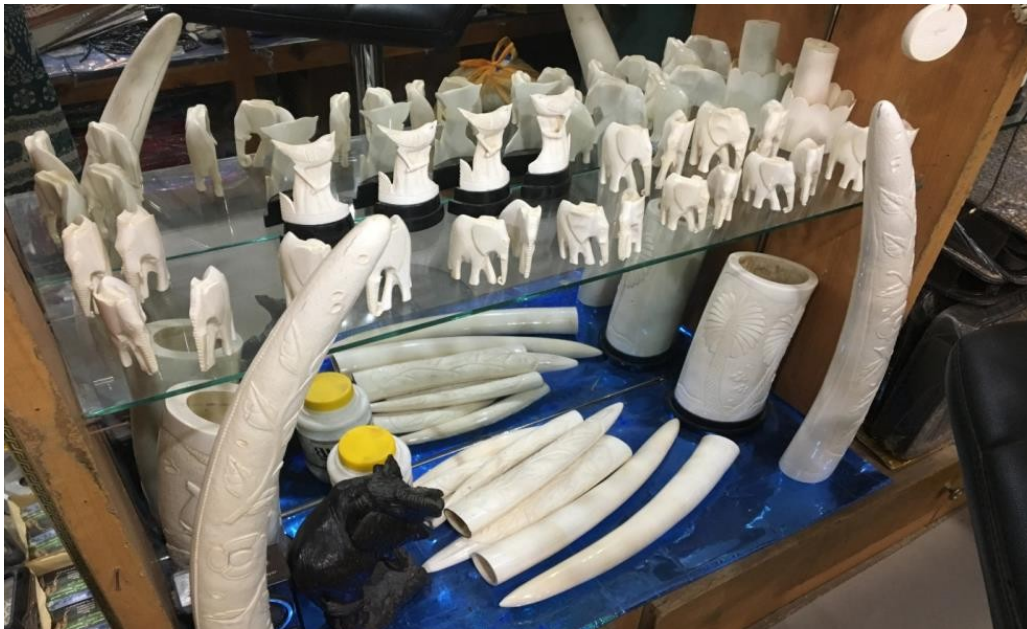
Fig. 4. Small tusks, ivory animal figurines and ivory brush pots for sale in Khartoum, Sudan, 2017

In alphabetical order I carried out fieldwork in China, Hong Kong, Japan, Lao PDR, Macau, Myanmar the Philippines, Thailand, and Vietnam (Annexes 17-27) again often on repeated visits to update findings and to help pinpoint areas of grave concern where efforts were/are needed to close down illegal markets, cited in various reports, such as that of UNODC (2020).