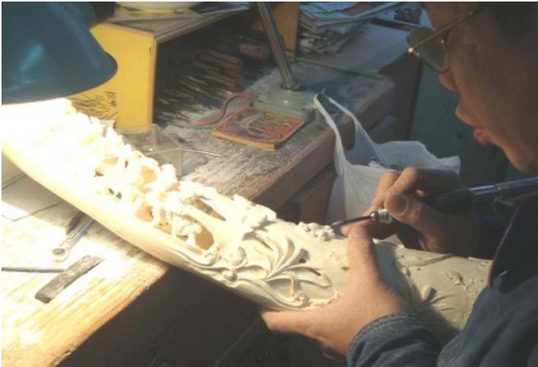
Fig. 1. Ivory carving in Guangzhou, China, 2011

who inspired me with his commitment to this field and with whom I worked on ivory and rhino horn market surveys and field research for 35 years, until his tragic murder at his home in Nairobi in early 2018.