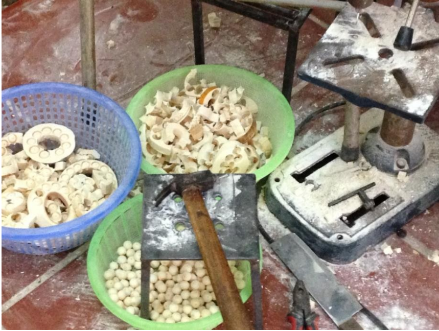
Fig. 7. Ivory bead-making from smuggled African tusks in northern Vietnam, 2015