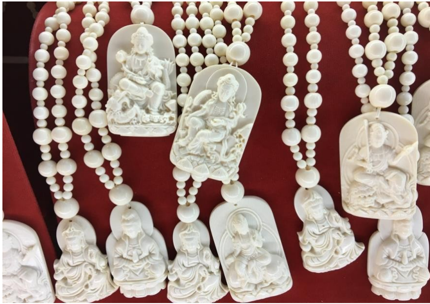
Fig. 9. Jewellery made from illegal African ivory for sale in Vientiane, Lao PDR, 2016