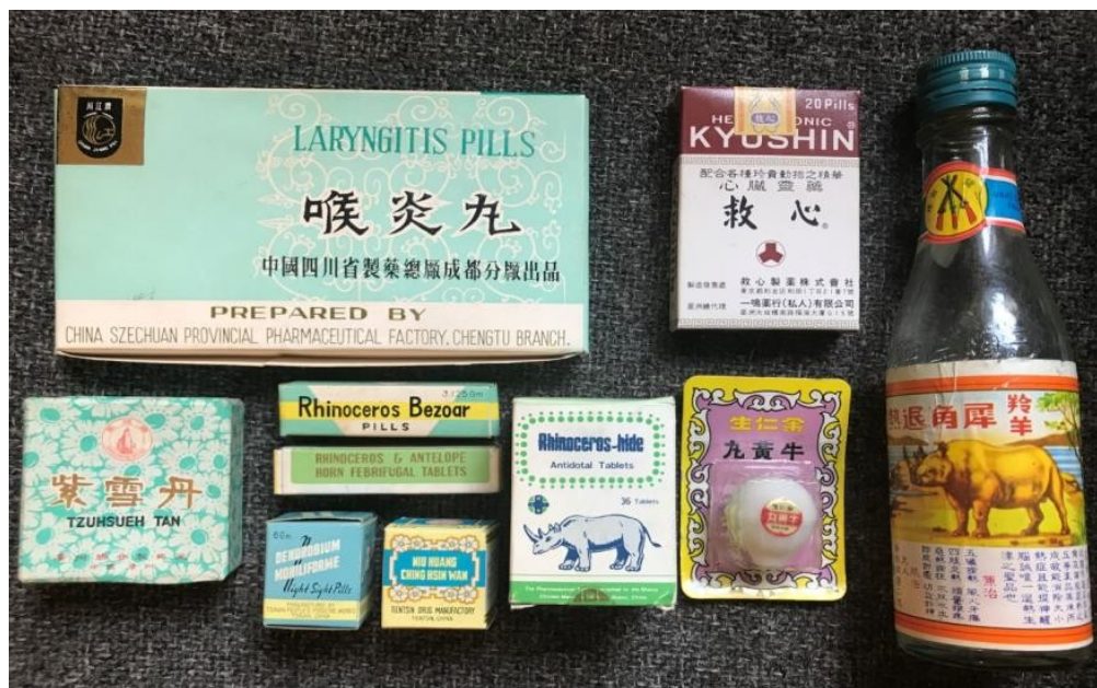
Fig. 2. Traditional Oriental medicines with rhino horn, for sale in the early 1980s in eastern Asia

NB. Most of my fieldwork was conducted with Esmond Martin in order for two people to gather more accurate data and for safety in sometimes dangerous places. I increasingly took the lead role collecting field data, analysing it and writing it up for publication. Following Esmond’s death, other researchers/co-authors have kindly confirmed my published work with Esmond in this thesis (Appendix 1). In my publications and in my thesis, prices are reported in USD for consistency in the exchange rate at the time of data collection, not corrected for inflation. I use the word ‘ivory’ for elephant ivory. The word ‘markets’ broadly refer to all retail outlets. I use tonnes (not tons) referring to 1,000 kg.