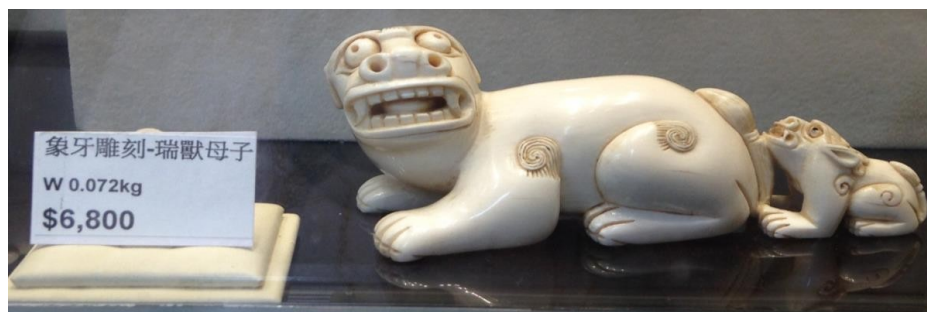
Fig.6. An ivory animal figurine of 7.2g in Hong Kong priced at USD 872 in 2015

Despite ivory's cultural importance, with patrons of the arts for centuries encouraging carvers, China intends to maintain its domestic ivory trade ban, as officials expressed at CITES CoP18 in Geneva in 2019. The legal trade had become a thorn in China's side. Hong Kong, also as a result of publicity and international pressure, agreed to end its legal domestic ivory trade (all supposedly old stock) on 31 December 2021 (Thomas 2018). Hong Kong, nowadays, is a significant entrepôt for illegal ivory shipments destined for China (ADMCF 2018). A ban will thus simplify enforcement by Customs and in shops (Bennett 2015), although the corrupt underground trade can flourish with criminal networks having the monopoly (Smith et al. 2015). Monitoring and law enforcement will be needed in Hong Kong before and even more after the planned 2021 domestic ivory trade ban to monitor trends (Tables 6 and 7).