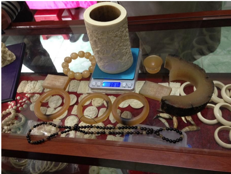
Fig. 8. Rhino horn and ivory items for sale in northern Vietnam, 2015