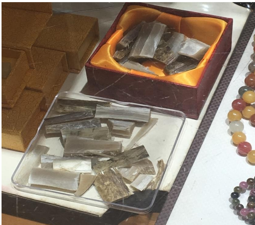
Fig. 10. Rhino horn chips for TCM in a Chinese market in Vientiane, Lao PDR, 2016