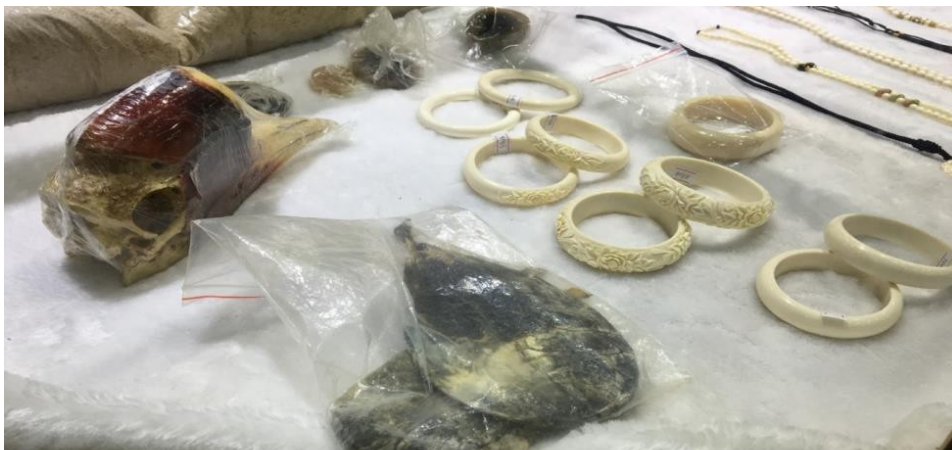
Fig. 3. Endangered wildlife products often sell together for the Chinese market: rhino horn pieces at the back, a helmeted hornbill skull with casque, two bear gall bladders and ivory jewellery.