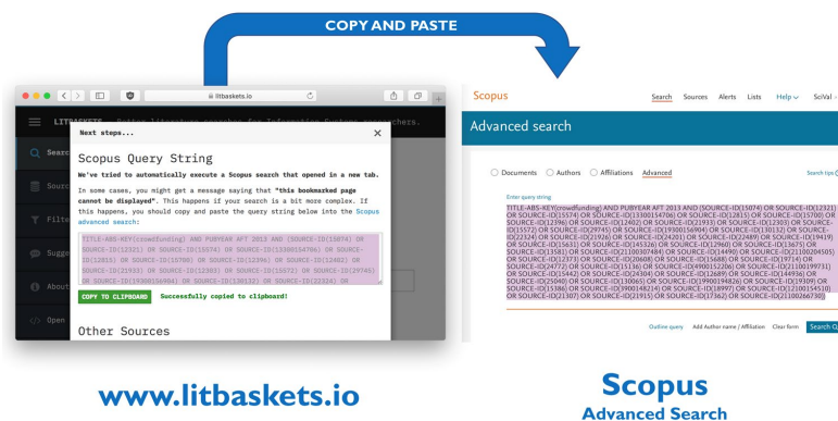
Figure 2. Transferring Scopus Query String into Scopus Advanced Search.

To proceed, we first matched the complete set of all journals identified by us (see Tables 1, 2) to their respective SOURCE-ID registered in Scopus. In the case of John Lamp's list a SCOPUS-ID was already provided for most journals for other lists used identifying features such as ISSN or journal titles. This process was facilitated by a relational database system (MySQL) in which we captured other useful attributes such as Scopus coverage years and journal URL, where applicable. Of the 1,042 unique journals identified during the discovery phase, 847 are indexed by Scopus (81%, see Table 2). As shown in Figure 1, all 51 journals included in 5 or more lists are currently indexed by Scopus with coverage in many cases is also going back several decades. Using the relational database of SOURCE-ID for IS journals we developed a web-based graphical user interface accessible at www.litbaskets.io in which users can generate search strings for Scopus' advanced search and customise the selection of journals. IS researchers can thus use our tool to generate elaborated search strings for Scopus advanced search that enables simultaneous search in up to 847 journals publishing research or interest to IS. All users have to do is copy the search string into Scopus' advanced search window (Figure 2).