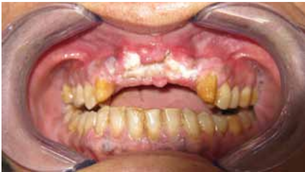
Figure 1: Exophytic, white keratotic view under white light examination.

still had these white lesions with swelling and pain this time. Thereon, the dentist who made the prosthetic rehabilitation undertook antibiotic treatment and referred the patient to our hospital (Fig. 1). Initially, fluorescence visualization examination (FVE) was performed by the assistance of VELscope (LED Dental Inc., White Rock, Canada) to decide the most favorable biopsy region. Concurrently, diascopy was conducted to set aside eventuality of inflammation. Two excisional biopsies were taken from two different and dark-colored fluorescence visualization loss (FVL) regions where it was considered as a potential carcinoma in situ (CIS)