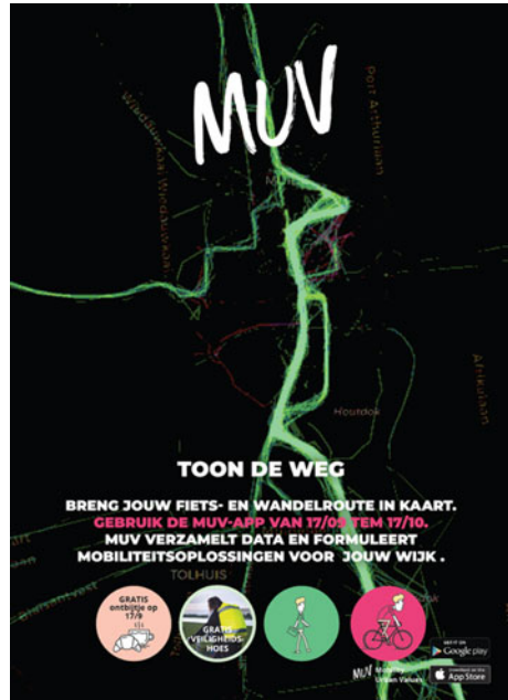
Fig. 2 MUVmap (Ghent)