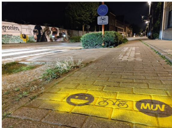
Fig. 3 Living MUV emoticons (Ghent)