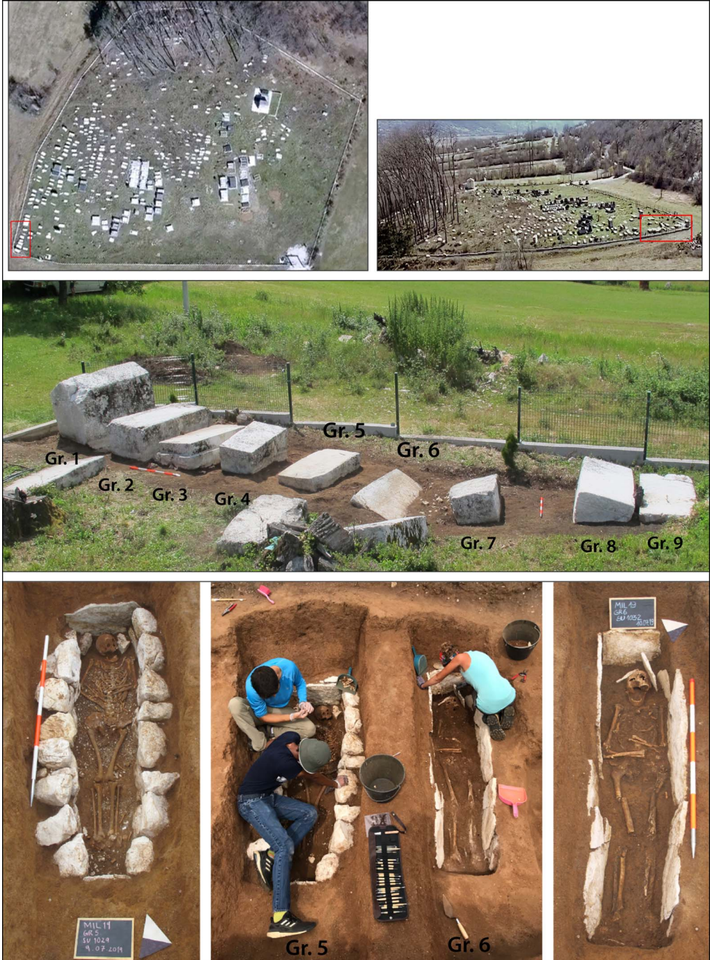
Figure 6. Milavići site: view of the cemetery with the studied area and excavated graves five and six.