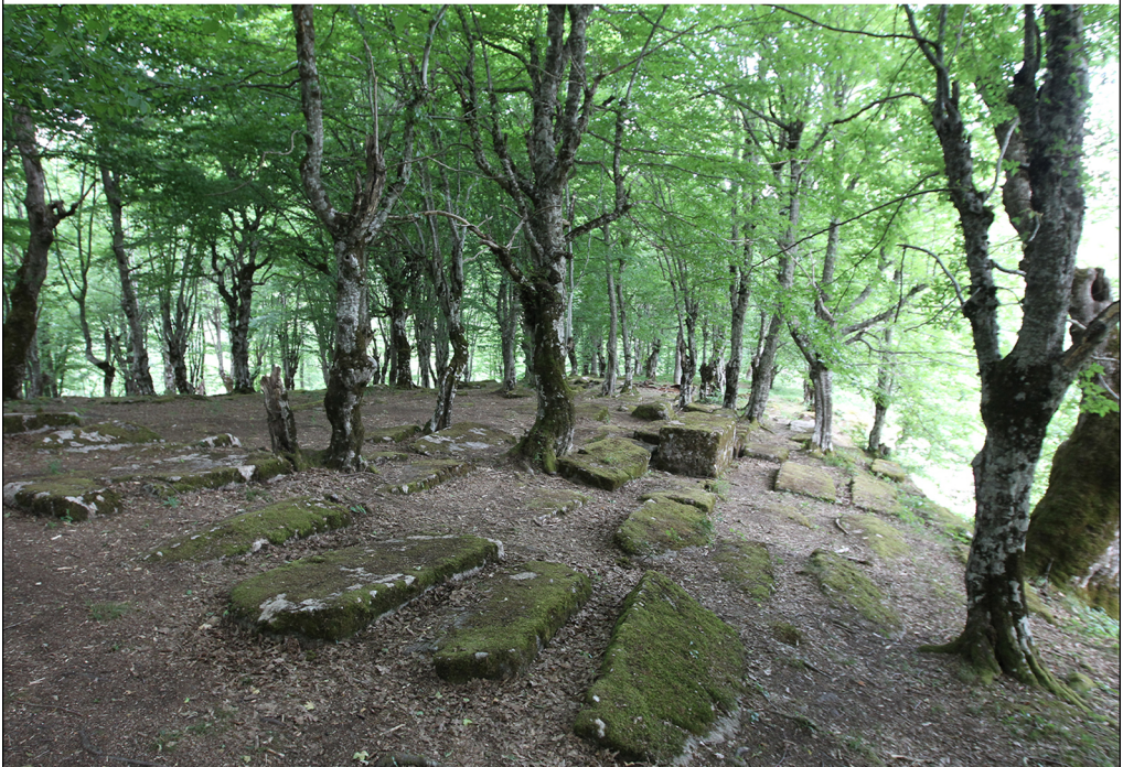
Figure 3. Stećci necropoles Goršiča polje by Goražde and Radimlja.