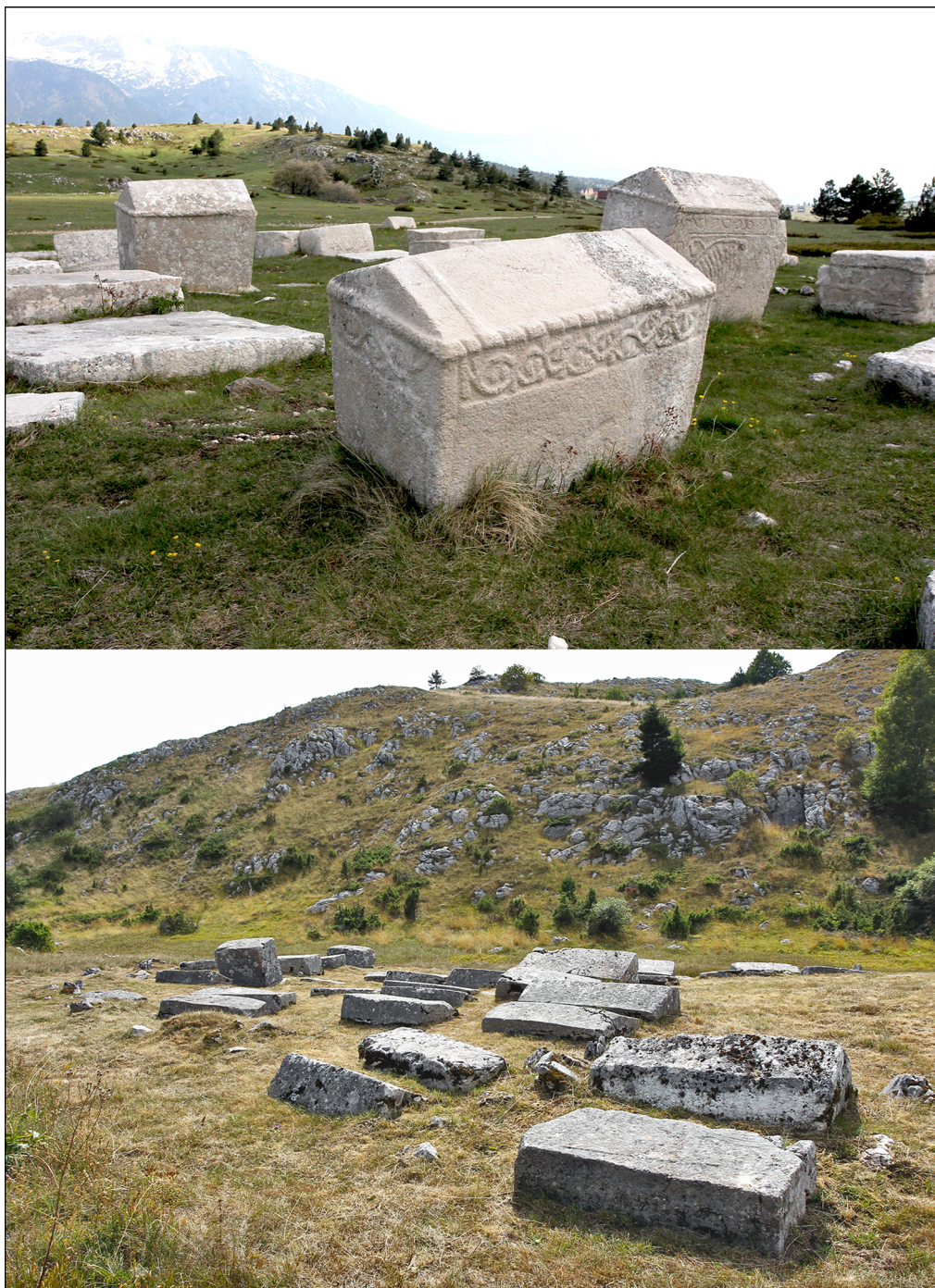
Figure 4. Stećci necropolises Blidinje-Jablanica and Gwozno-Kalinovik.