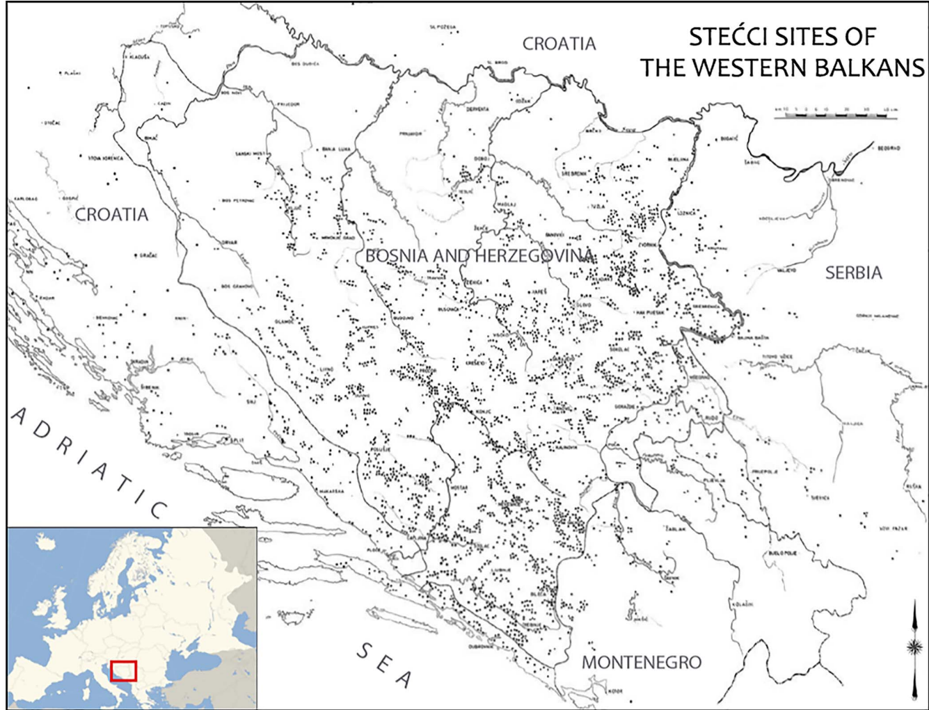
Figure 1. The distribution of approximately 3300 sites of stećci monuments in the Western Balkans (adapted after Bešliagić 1971).