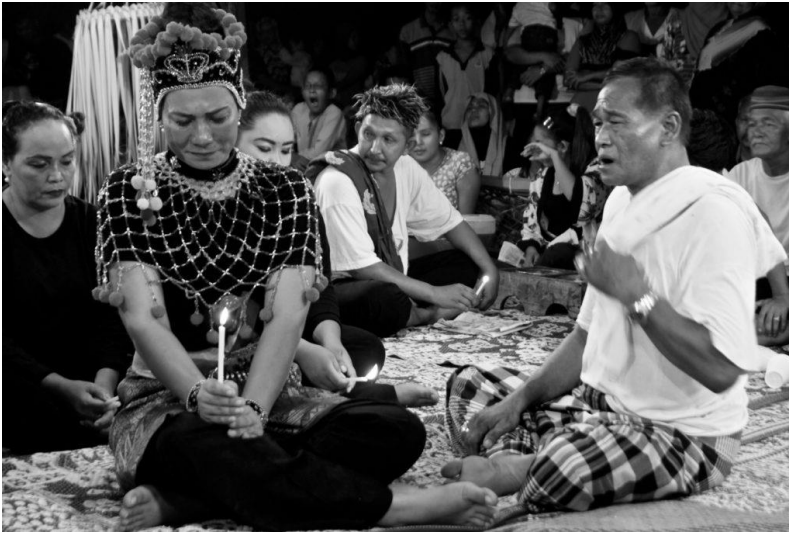
Figure 4: Mak yong in ritual

(https://www.newmandala.org/mak-yong-in-may-sembah-guru/)