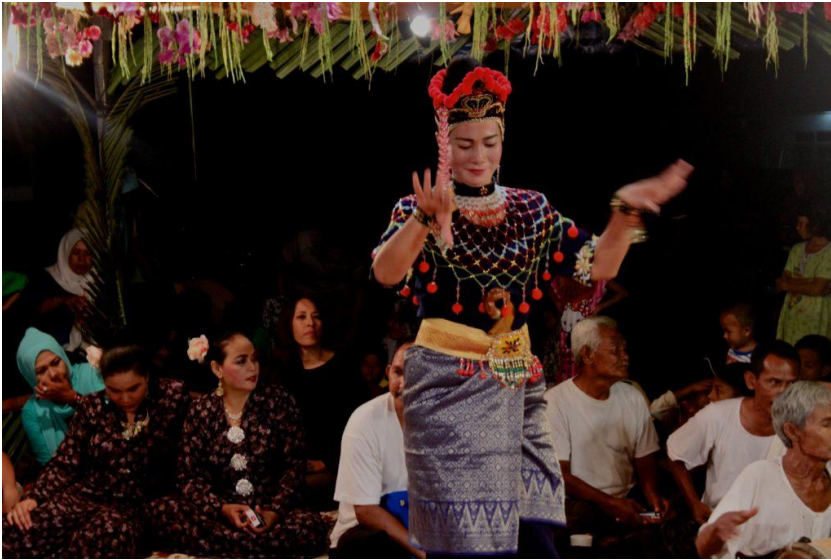
Figure 3 : Mak Yong (Makyung)

The Makyung tradition was preserved until the 1960 and 1970. Subsequently, the PAS (Malaysian Islamic Party), a political party in Kelantan that was influenced by the Islamic Revolution, came to power and banned the non-Islamic elements of traditional dance-drama performances.