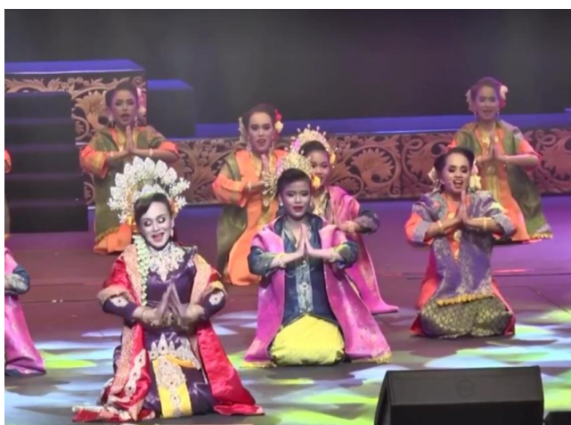
Figure 8: Mek Melung performed by The National Department for Culture and Arts in 2018