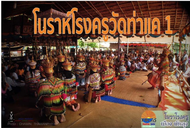
Figure 1: Norah at Ban Tha Khae in Phatthalung ( https://youtu.be/aQ6V1G4h_UI )