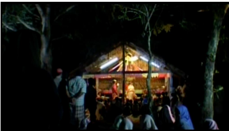
Figure 5: Mek Melung of Kg.Wang Tepus in Kedah