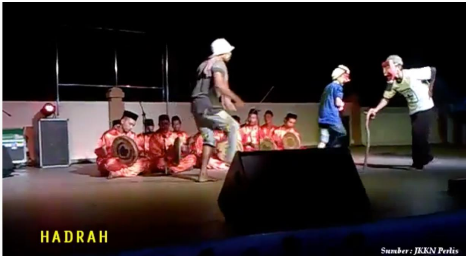
Figure 7: Hadrah in Perlis

in order to commence the dance. The dance tells the story of a woodcutter who has lost his way and wanders around, beats woods with a bamboo stick and praying, and returns village safely. This dance is said to have begun as a celebration of his return (Mohd Taib Osman 1982).