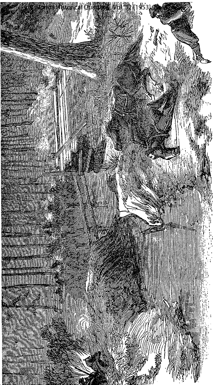
Scene of the fight at the Plank Bridge over Big Creek, at Barber's, February 19, 1864.