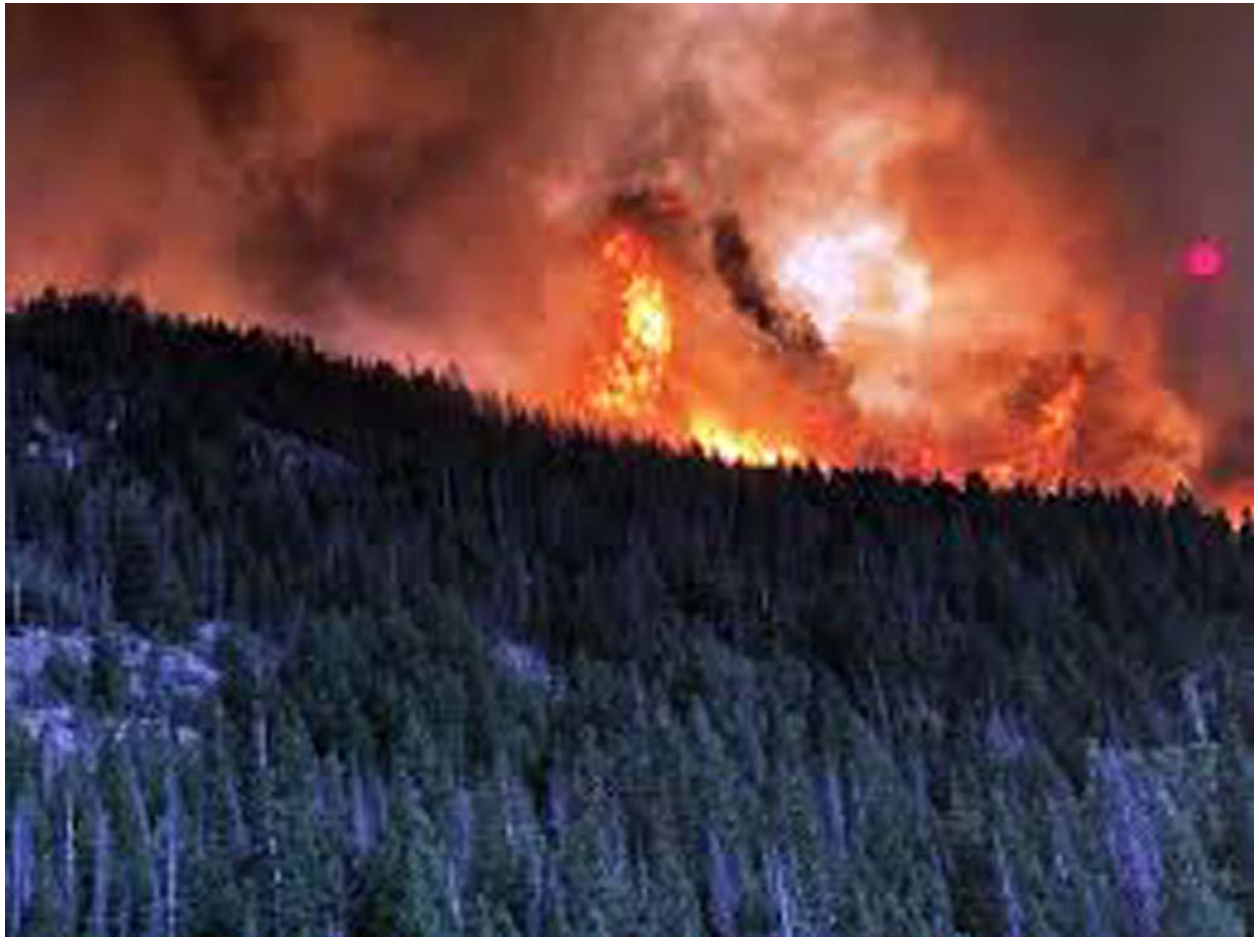
Cameron Peak Fire