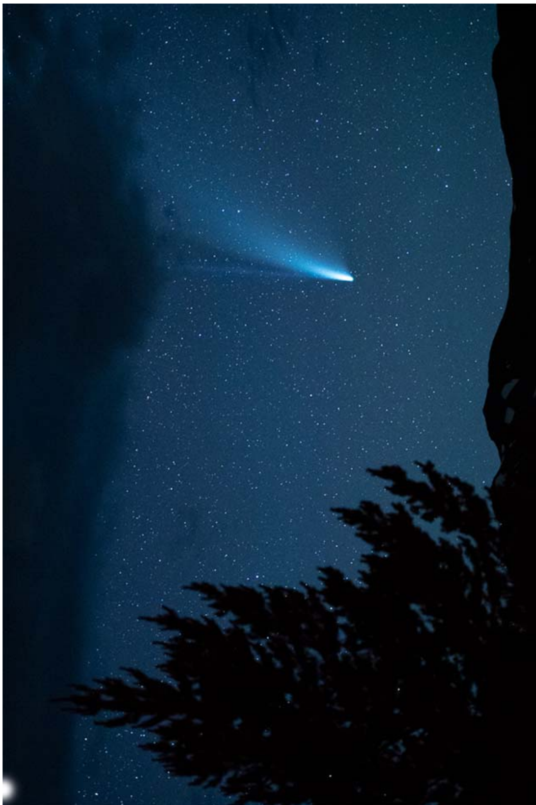
Comet Neowise - July 2020