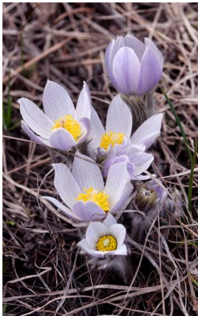
Apr 10, 2020 Lory State Park

Lots of spring beauty, Claytonia lanceolata one Clematis in bloom. salt-and-pepper, Limnodium orientale