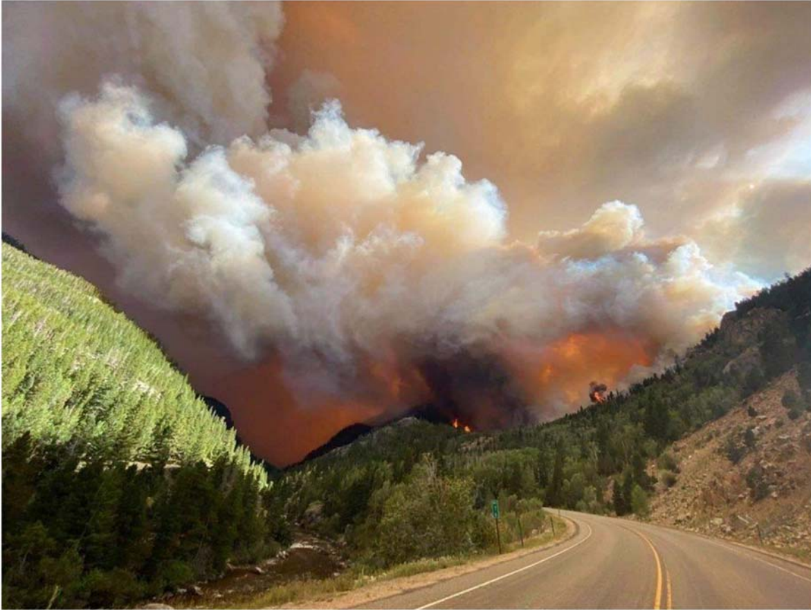
Chambers Lake = Cameron Peak Fire - August 18, 2020 - from Poudre Pass Road

Sept. 24, Monday. Drive to see aspen. Left about 9.00 a.m., lots of confusing active road reconstruction south of Loveland in the Berthoud area and got lost trying to get to the Lyons road, route 66. Eventually found it, with the help of the construction crew.