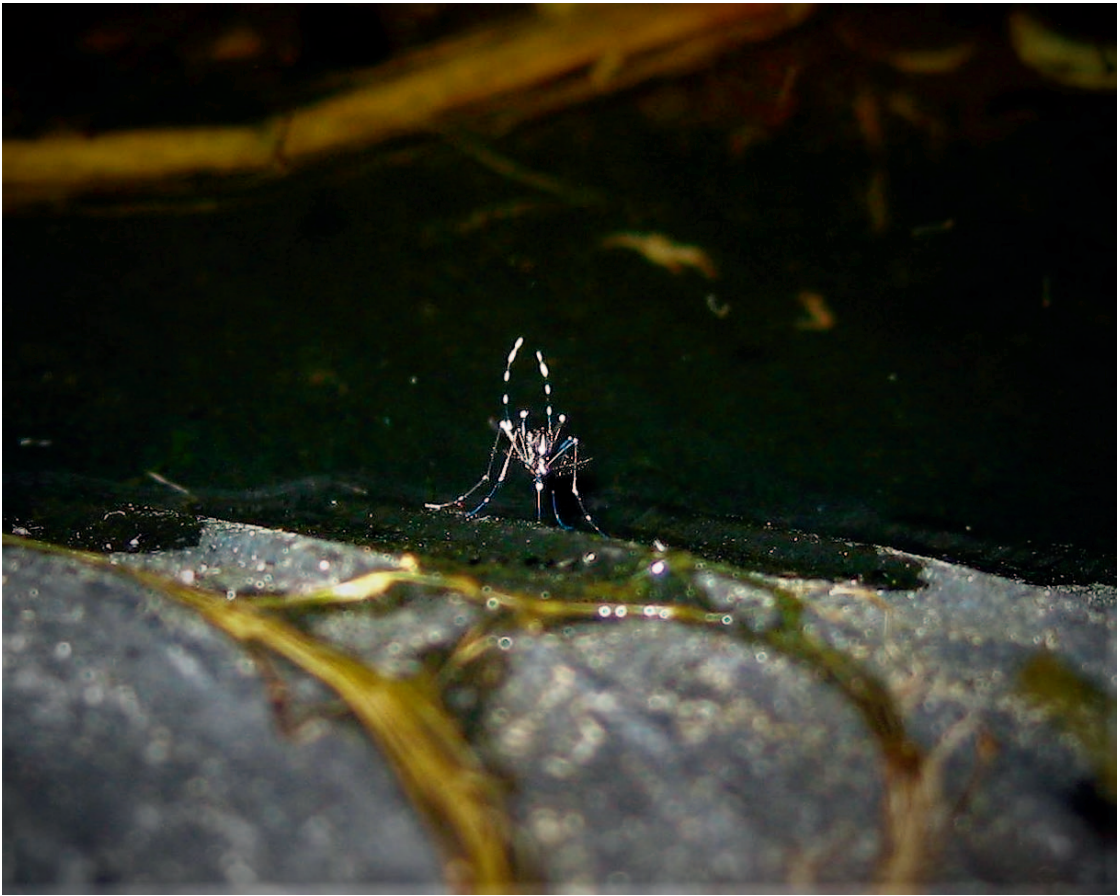
Fig. 2. Female of Aedes albopictus resting in a discarded tire at San Pedro Nohpat, suburban area of Merida, Yucatan, Mexico.

the Ministry of Health in Yucatan of the presence of this invasive species. As a quick response, the vector control program in collaboration with the Collaborative Unit for Entomological Bioassays (UCBE) would conduct integral strategies for effective detection and control of the vector mosquito in urban and suburban areas in Yucatan.