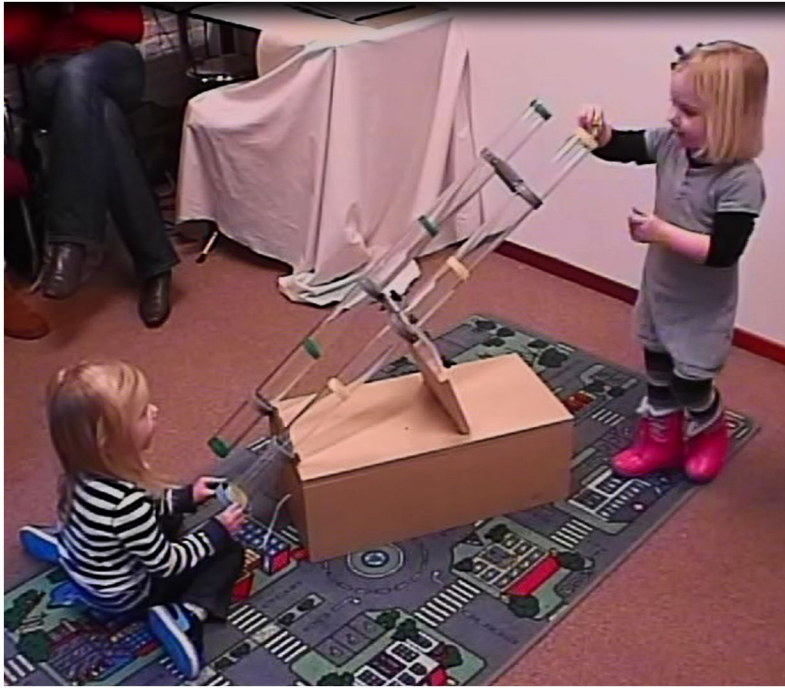
FIGURE 1 Children coordinating their actions during the cooperation task