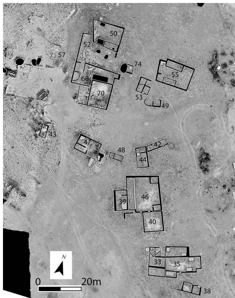
Fig. 3: Plan of the Umm an-Nar settlement at WAJAP-S63 (Site 63), located in the Wadi Fizh, near the village of Falaj.

The buildings at Site 63 vary considerably in size, from about 30 m 2 to over 300 m 2 . What is remarkable is the enormous size of many of these structures. The buildings take on two main forms. First, there are buildings consisting of one or two rooms, such as for example buildings 42, 44, and 48. Second, there are a number of large rectangular walled spaces that have interior proportions of up to 10 x 12 m, such as buildings 35, 46, and 70. Clearly, these spaces are too large to have been roofed, unless there were extra walls sub-