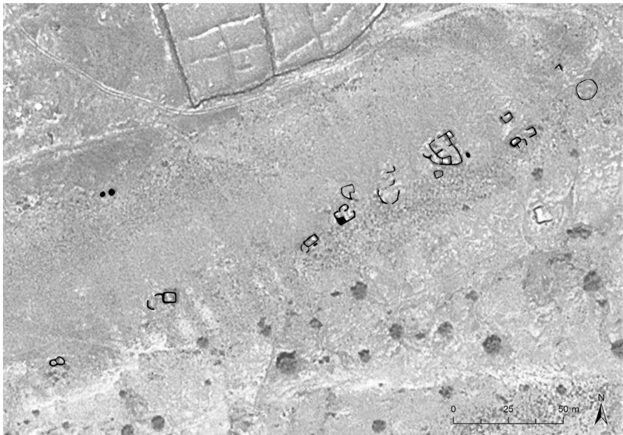
Fig. 4: Plan of WAJAP Site 2.

densities of Umm an-Nar pottery were found in the rooms than in the courts. Such an arrangement of the larger courtyard structures could suggest a seasonal use of the site, something which has been suggested also for other Umm an-Nar settlement sites. 24