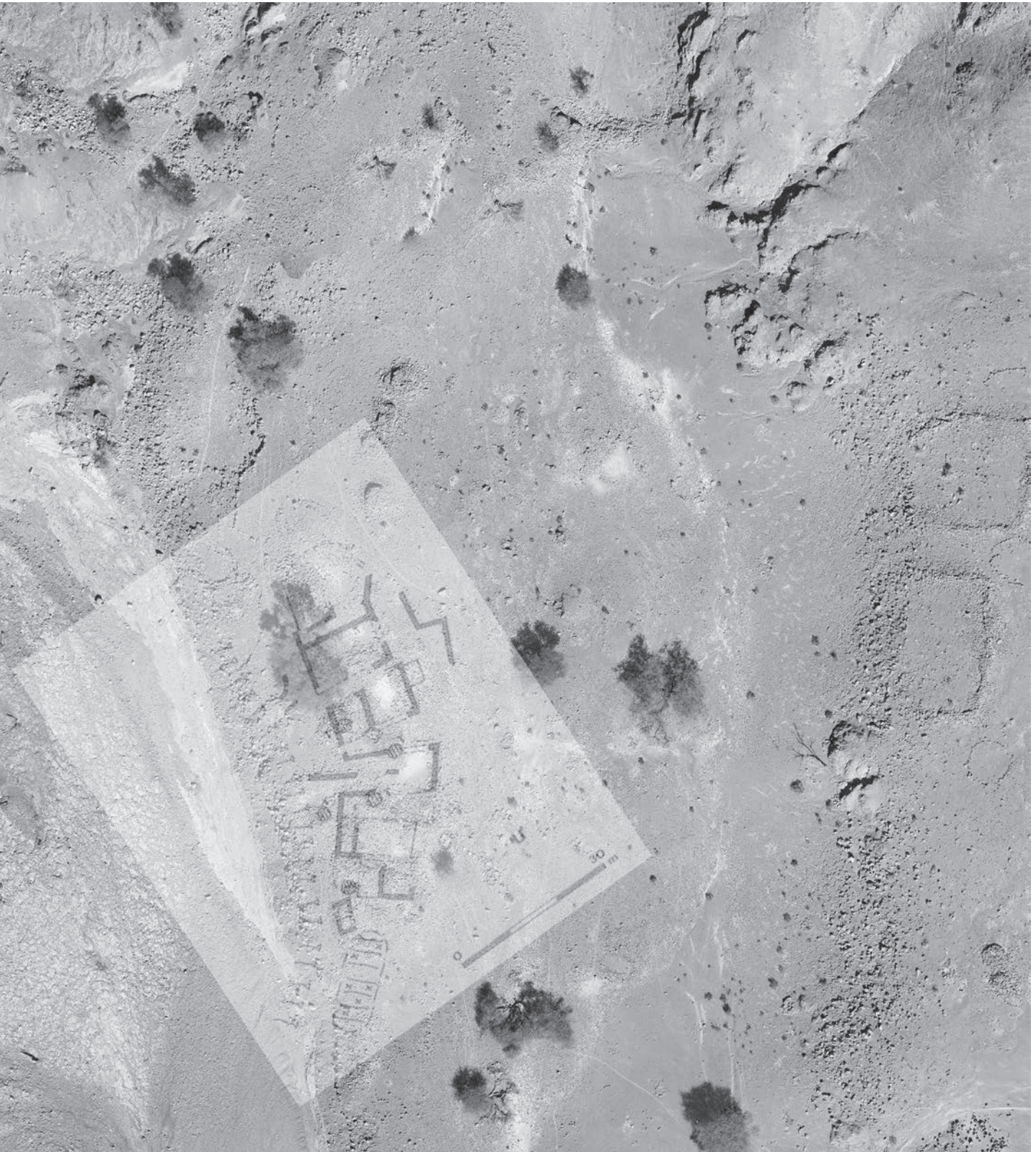
Fig. 2: Aerial photo of settlement 'U', Zahra Site 1, with plan of Costa and Wilkinson superimposed.