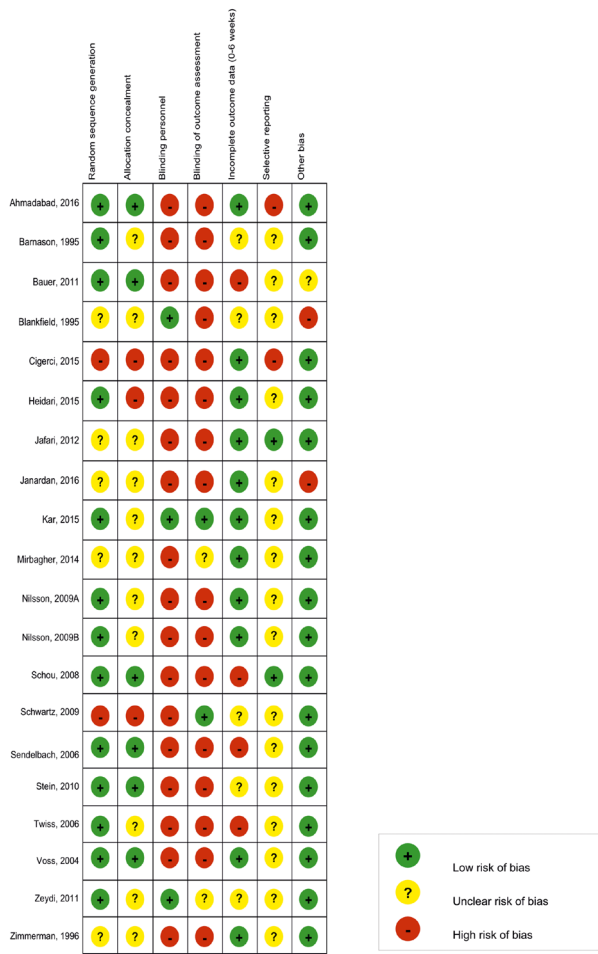
Figure 2 Risk of bias assessment.

p<0.10). The forest and funnel plots concerned are shown in Supplementary data S5).