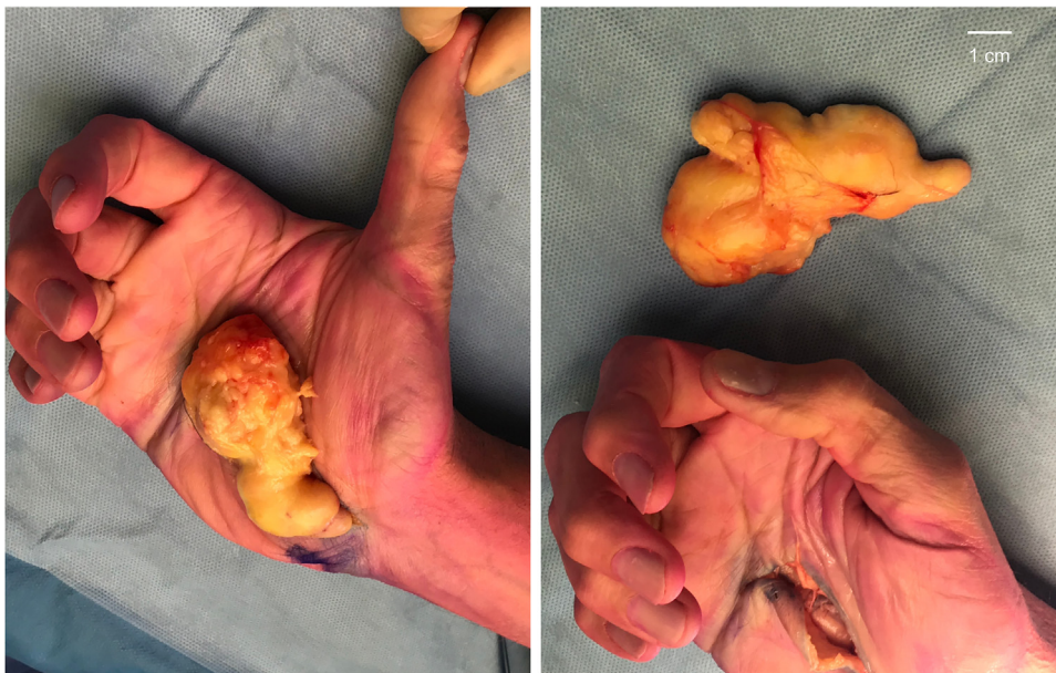
Fig. 2. Total excision of the giant lipoma of the hand, measuring 4,8 \times 1,8 \times 8,6 cm. The carpal tunnel and Guyon's canal were released to relieve pressure on the median and ulnar nerves.

tive Surgery outpatient clinic with a growing mass in his left palm, which suddenly appeared 18 years ago and had not increased in size before. However, it recently started to grow, causing progressive symptoms of pain and loss of sensory and motor function of both the median and ulnar nerve. Clinically, the mass was localized in the hand palm, ulnar from the thenar eminence and measured approximately 4 \times 4 cm. No relevant diseases or medication use were reported. The patient did not have a history of smoking or drug/alcohol abuse.