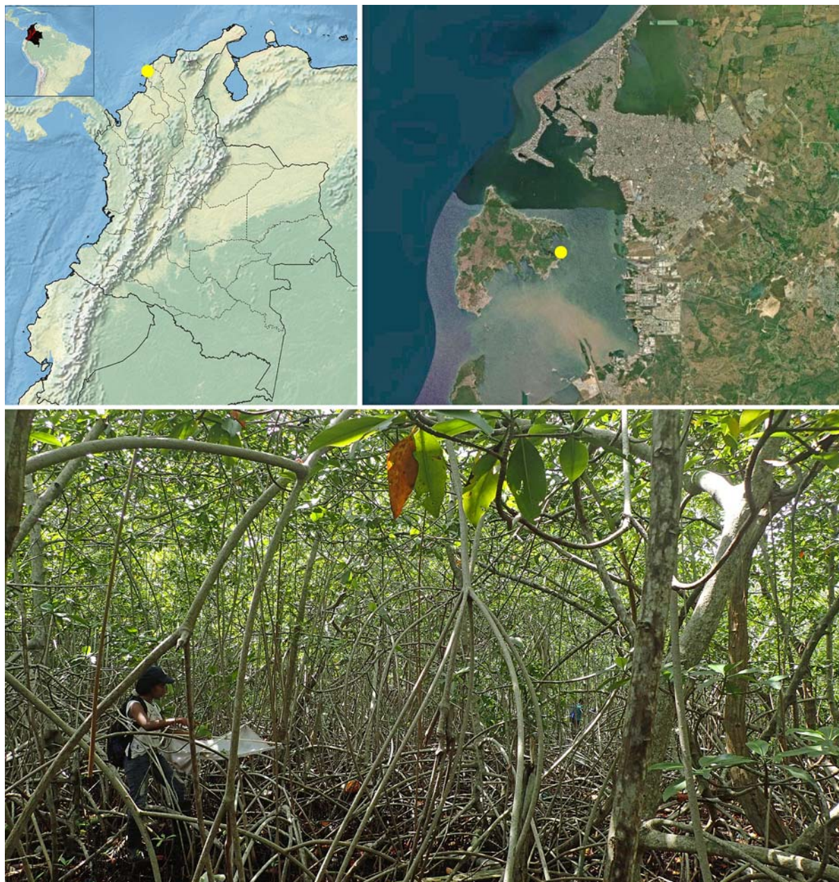
Fig. 12. Distribution map and a representative ecosystem of the type locality of Anasaitis champetera sp.n., from Sector Chavó, Caño del Oro, Tierra Bomba island, Cartagena (Bolívar), Colombia.

Рис. 12. Карта распространения и образец экосистемы из типового локалитета Anasaitis champetera sp.n., из Каньо дель Оро, остров Тьерра Бомба, Картахена (Болívar), Колумбия.