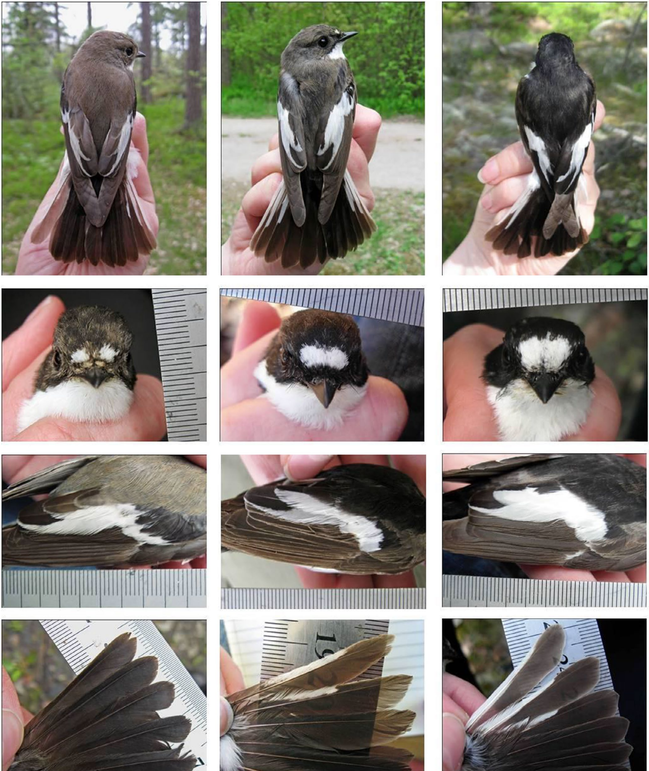
FIGURE 2 Some examples of males with different dorsal coloration, forehead, wing, and tail patches photographed in southern Finland. Within-population variation in the most variable populations represents substantial proportion of among-population variation

completely brown to black (Drost, 1936; Lundberg & Alatalo, 1992). Melanins (in contrast with carotenoids) are endogenously produced, and variation in their formation and deposition are known