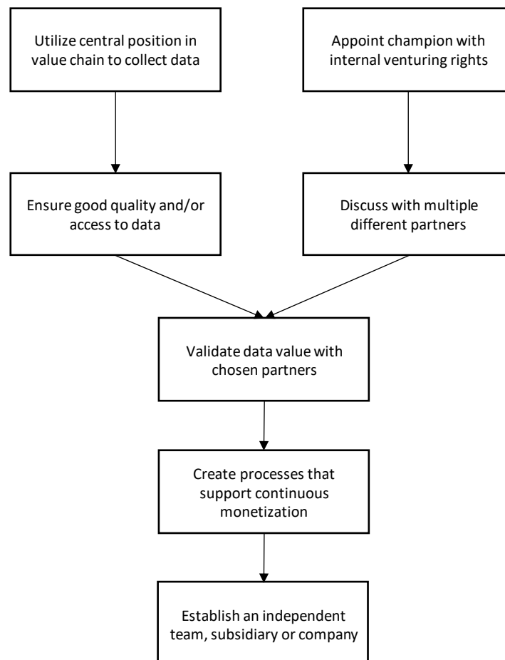
Figure 2. Recommended Steps on the Path to Data Monetization