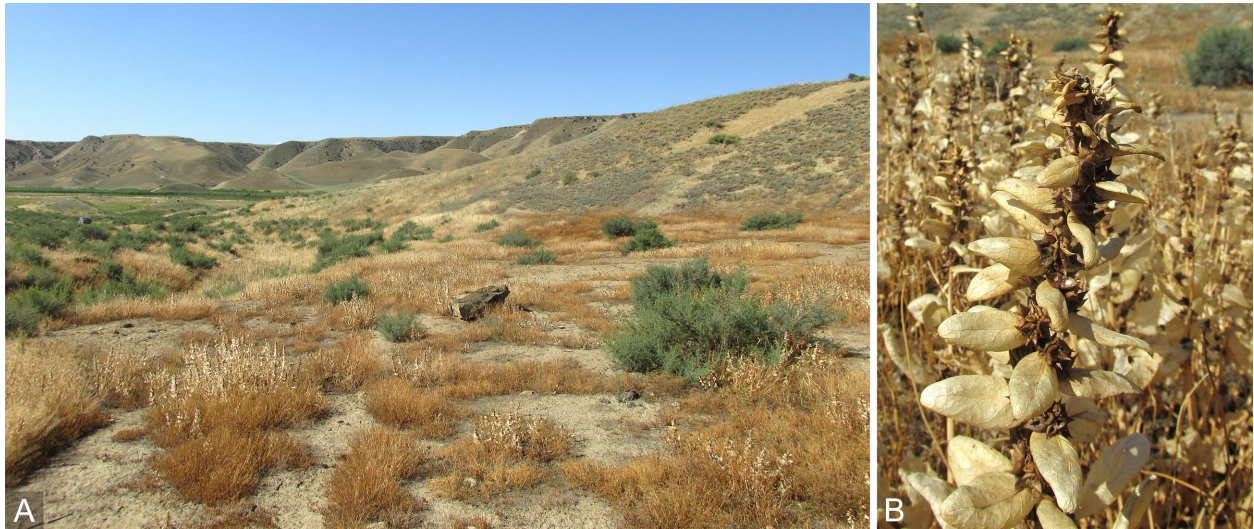
Fig. 1. Spinacia tetrandra – A: habitat; B: upper part of fruiting shoot. – Russia: Dagestan, Derbent district, 4 km W of Muzaim, valley of Kamyshchay river, 13 Jun 2018, photographs by A. V. Fateryga.

anthropogenic influence (Fig. 1A), the species seems to be native for Dagestan.