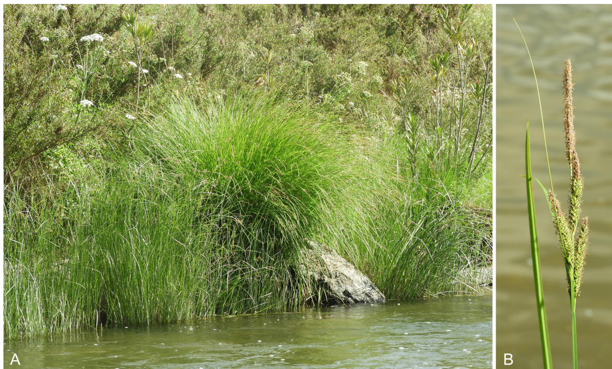
Fig. 3. Carex reuteriana subsp. mauritanica – A: habit and habitat; B: detail of inflorescence with male and androgynous spikes. – Portugal: Alentejo, Baixo Alentejo, Beja district, between Paymogo (Huelva, Spain) and Vales Mortos, international bridge over Chanza river, 21 May 2018, photographs by S. Martín-Bravo.

from C. canariensis by several morphological characters (see Luceño 2008; Molina & al. 2008): leaf size (usually more than 4 mm wide in C. canariensis vs up to 3.5(–4.3) mm wide in C. divulsa and C. pairae ), inflorescence morphology (longer, paniculate and conspicuously branched in C. canariensis vs shorter, spicate, unbranched, or branched only at base in C. divulsa and C. pairae ), and utricle appearance (ovoid to ovoid-lanceolate, conspicuously nerved on proximal half in C. canariensis vs ovoid-elliptic to elliptic and nerveless to faintly nerved at base in C. divulsa and C. pairae ). Therefore, a thorough revision of herbarium specimens (in local Madeiran herbaria or in other herbaria known to include important Madeiran collections such as BM and K) could result in a wider distribution of C. canariensis in Madeira, with historical collections possibly supporting a native status. This would be the 12 th native Carex species reported for the Madeiran archipelago (Jardim & Menezes de Sequeira 2008; Govaerts & al. 2018+). Although the collected specimens were rather immature, the morphology of the Madeiran plants agrees fairly well with its identification as C. canariensis after comparison with representative collections and high-resolution pictures of the type material. Moreover, we have preliminarily as-