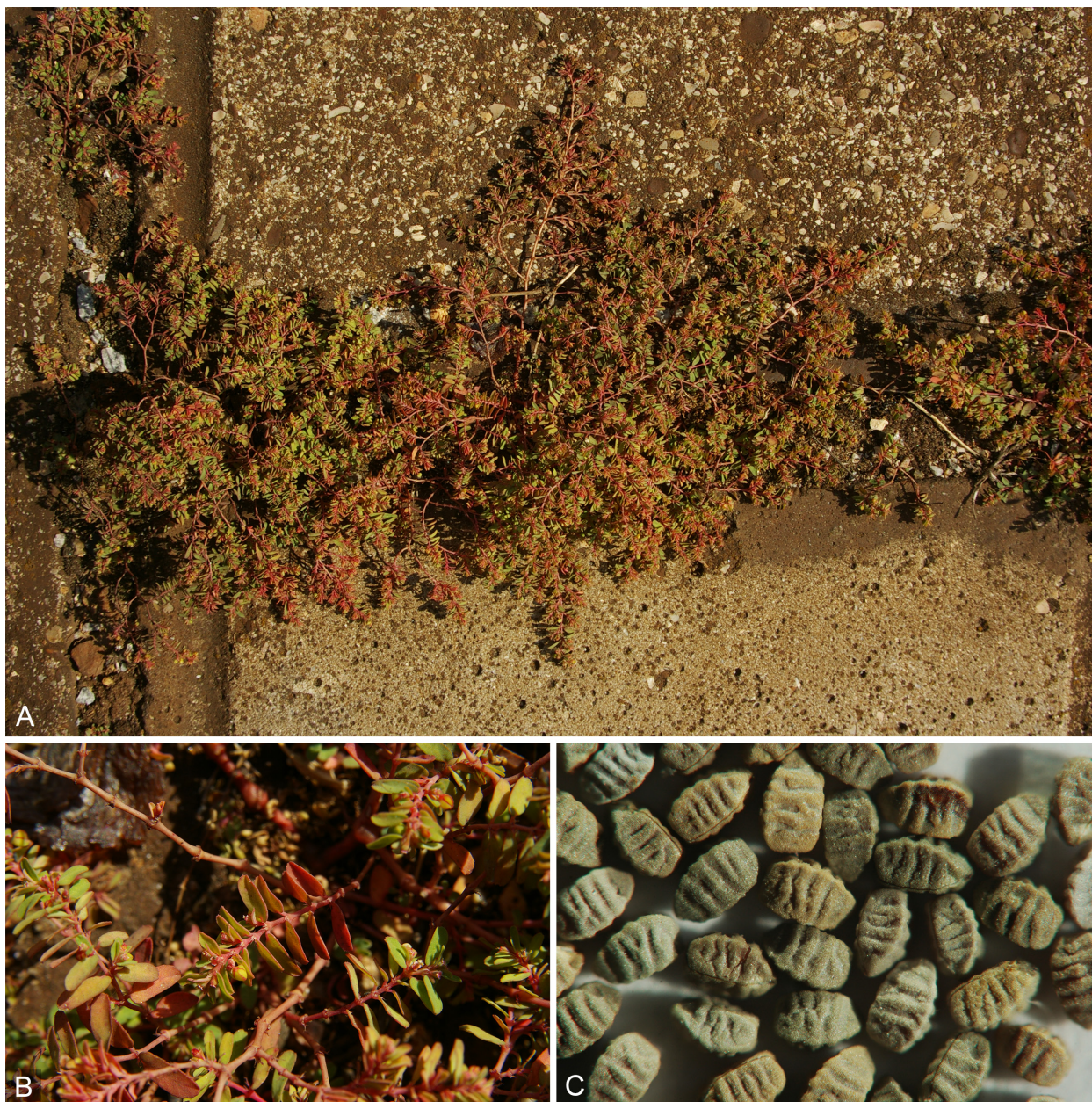
Fig. 4. Euphorbia glyptosperma – A: habit; B: flowering and fruiting shoots; C: seeds. – Crimea: Dzhankoykiy district, railway station Solenoe Ozero, 2 Oct 2011, photographs by S. Svirin.

of South America (Peru) and W Asia (Caucasus, Russia) (Govaerts & al. 2019; Geltman & Medvedeva 2017). However, the main area of its introduction is Europe, where E. glyptosperma has been known since the beginning of the 20 th century. This species is currently listed for at least 11 countries of Europe: N (Sweden), C (Austria, Belgium, Hungary, Netherlands, Switzerland), SW (France, Spain) and SE (Italy, Romania, Republic of North Macedonia) (DAISIE 2008+; Somlyay 2009; Geltman & Medvedeva 2017; Randall 2017; Sîrbu & Şuşnia 2018). In E Europe, E. glyptosperma was introduced in the 1980s, but was correctly identified only recently. Now it is recorded in a number of regions