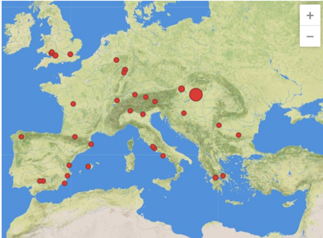
Figure 4: Peripleo place distribution visualisation, showing results for “defixio”

coordinate information for each geographical identifier, along with the individual texts from which the place is referenced. It is expected that as a rule the EpiDoc corpus will store only the references and identifiers, and geographical and spatial information will be retrieved from the record in the gazetteer. 18